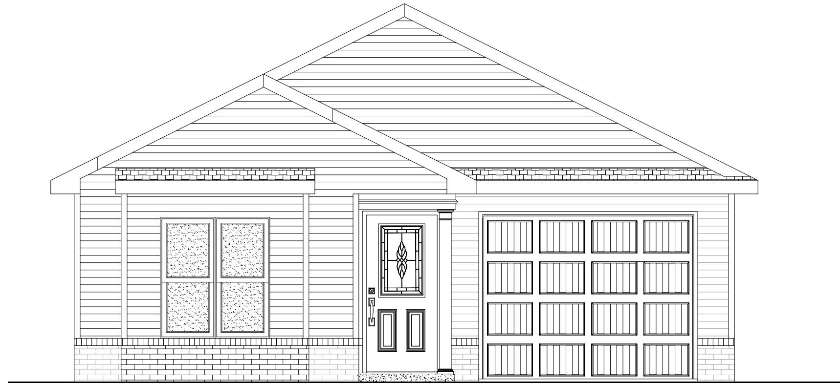
ELEVATION C - BRICK FRONT CEDAR TRACT HOUSE