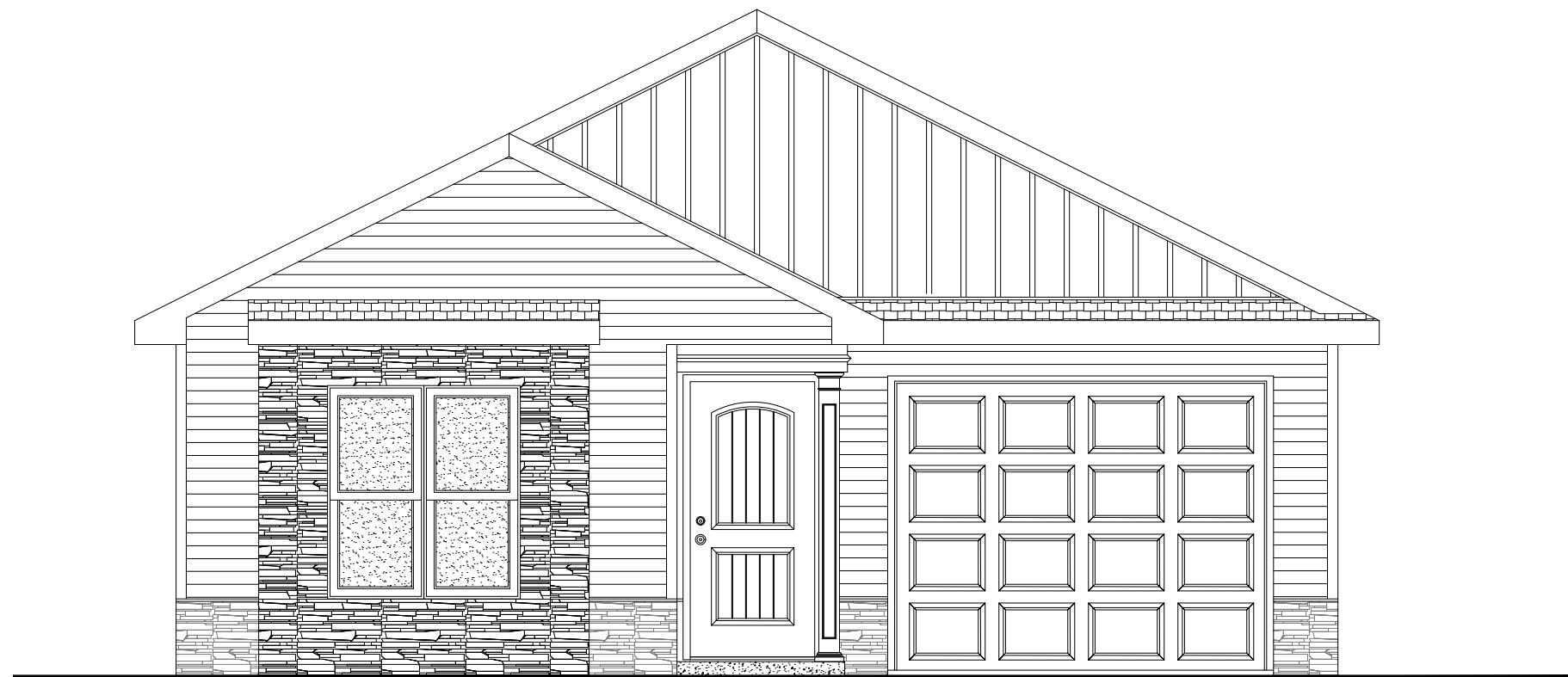
ELEVATION B - STONE FRONT CEDAR TRACT HOUSE