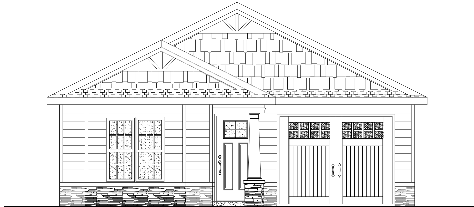
ELEVATION D - CRAFTSMAN CEDAR TRACT HOUSE