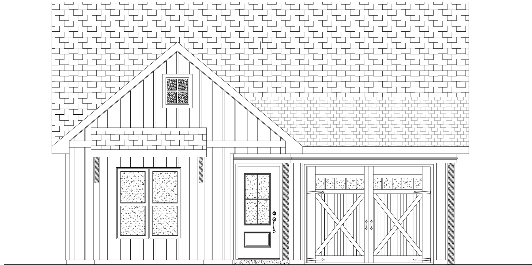
ELEVATION E - FARM HOUSE CEDAR TRACT HOUSE