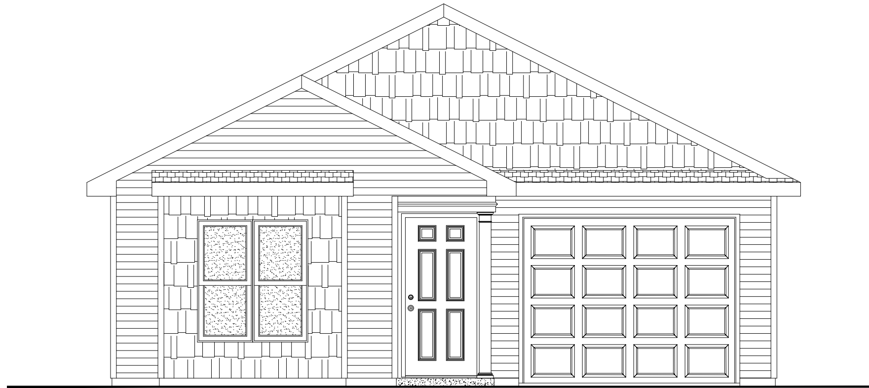
ELEVATION A - BASE VINYL CEDAR TRACT HOUSE