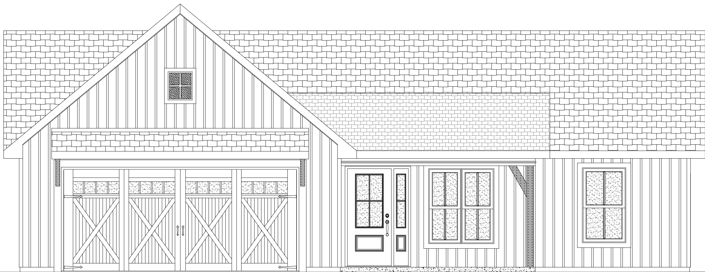
ELEVATION E - FARM HOUSE REDWOOD TRACT HOUSE