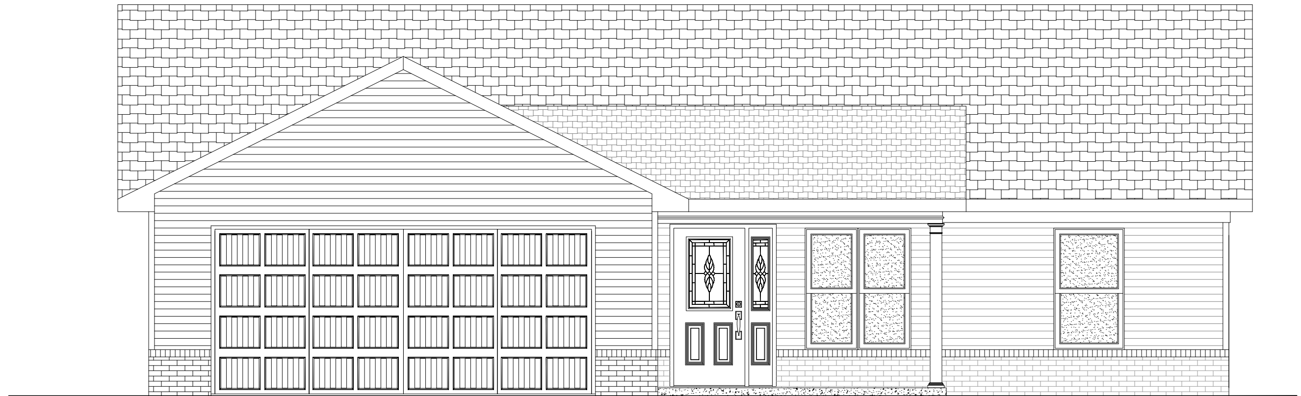
ELEVATION C - BRICK FRONT REDWOOD TRACT HOUSE