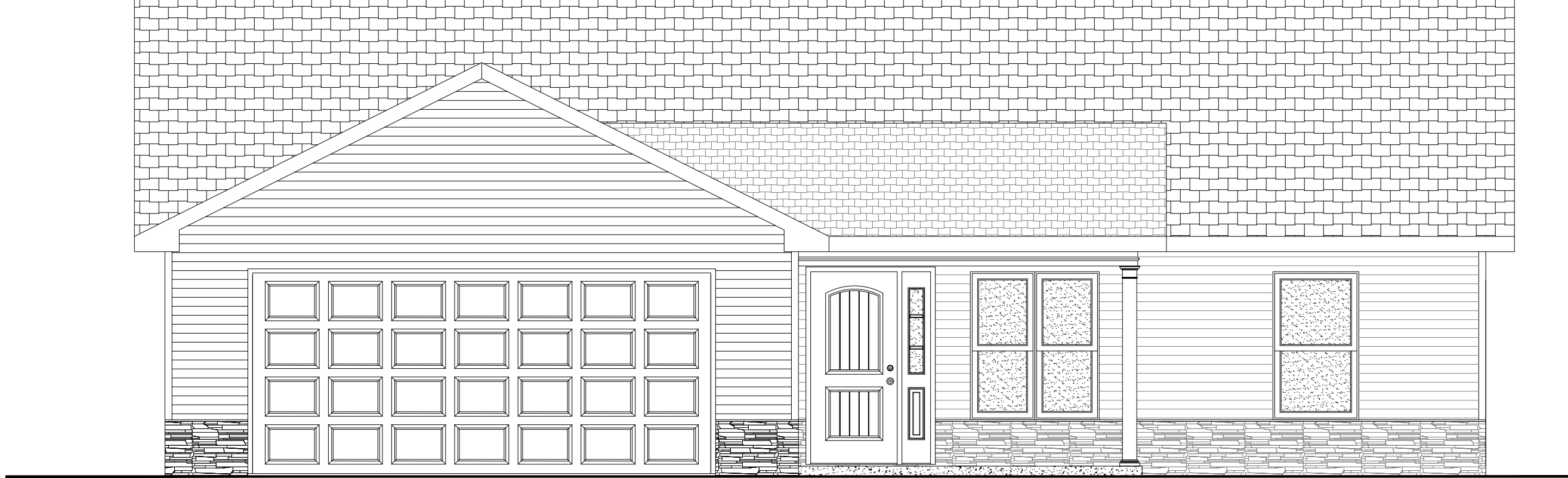
ELEVATION B - STONE FRONT REDWOOD TRACT HOUSE