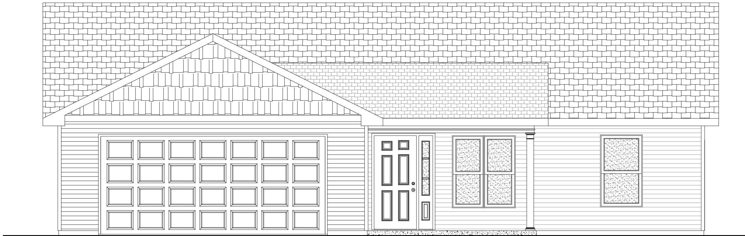
ELEVATION A - BASE VINYL REDWOOD TRACT HOUSE