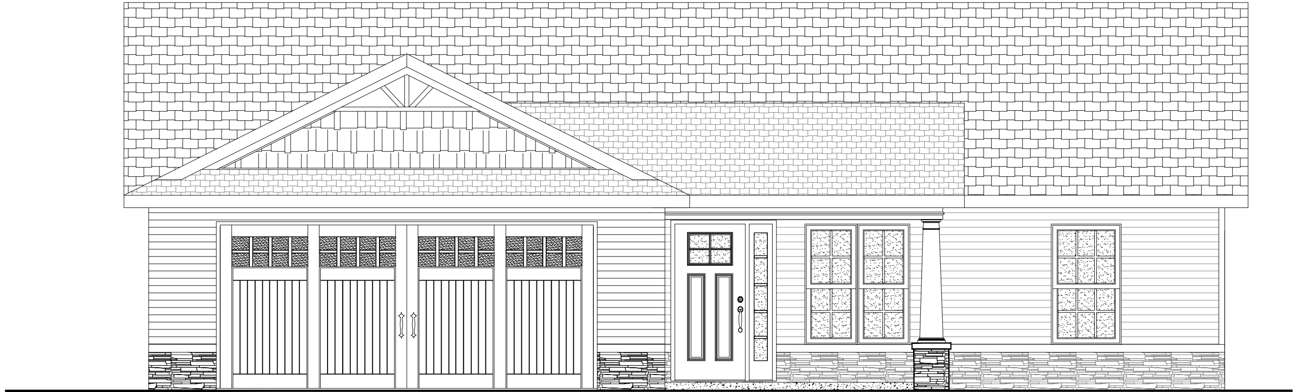
ELEVATION D - CRAFTSMAN REDWOOD TRACT HOUSE