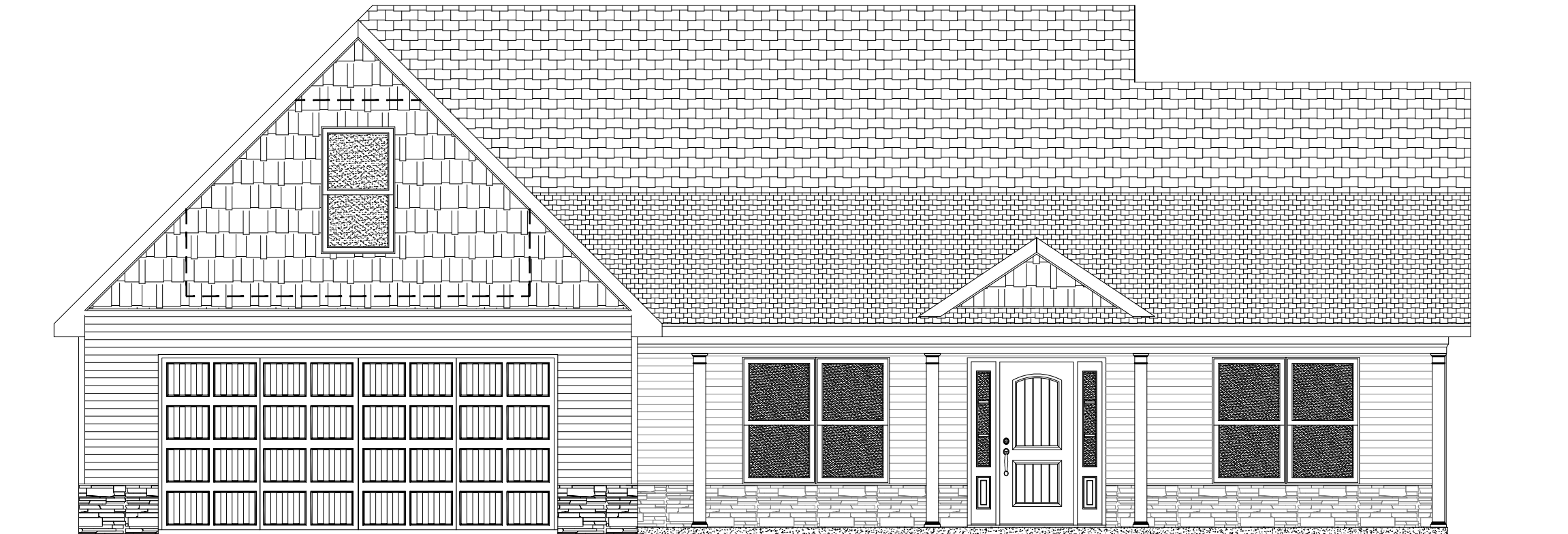
ELEVATION B - STONE FRONT HICKORY TRACT HOUSE