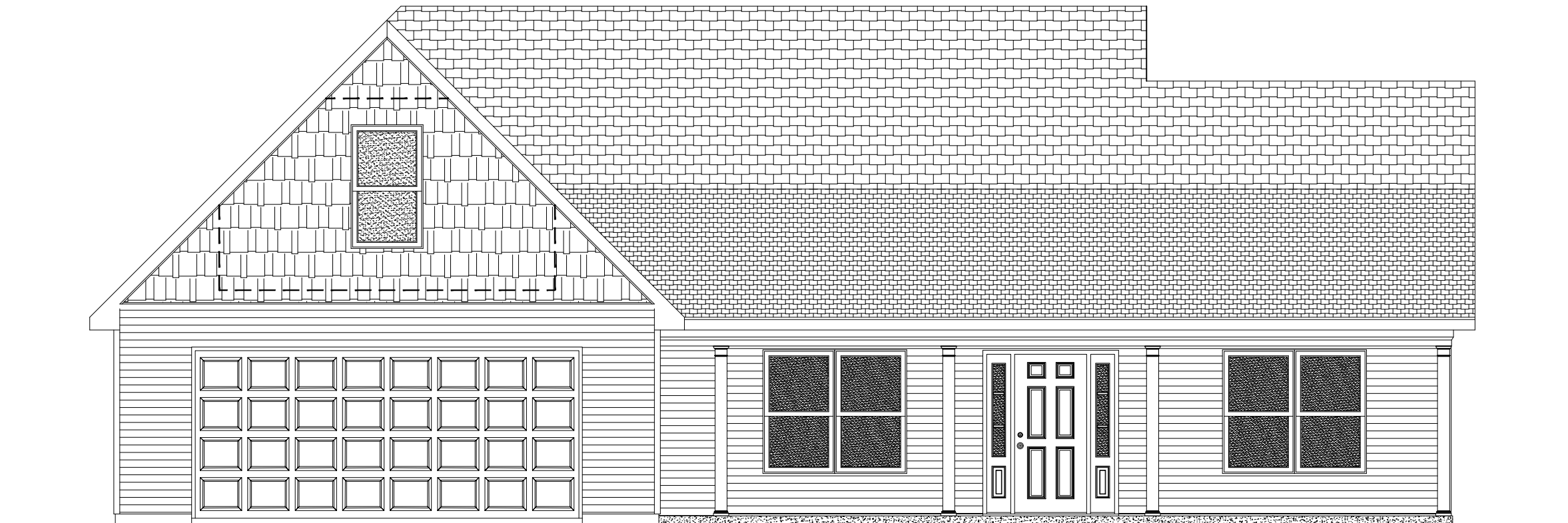
ELEVATION A - BASE VINYL HICKORY TRACT HOUSE