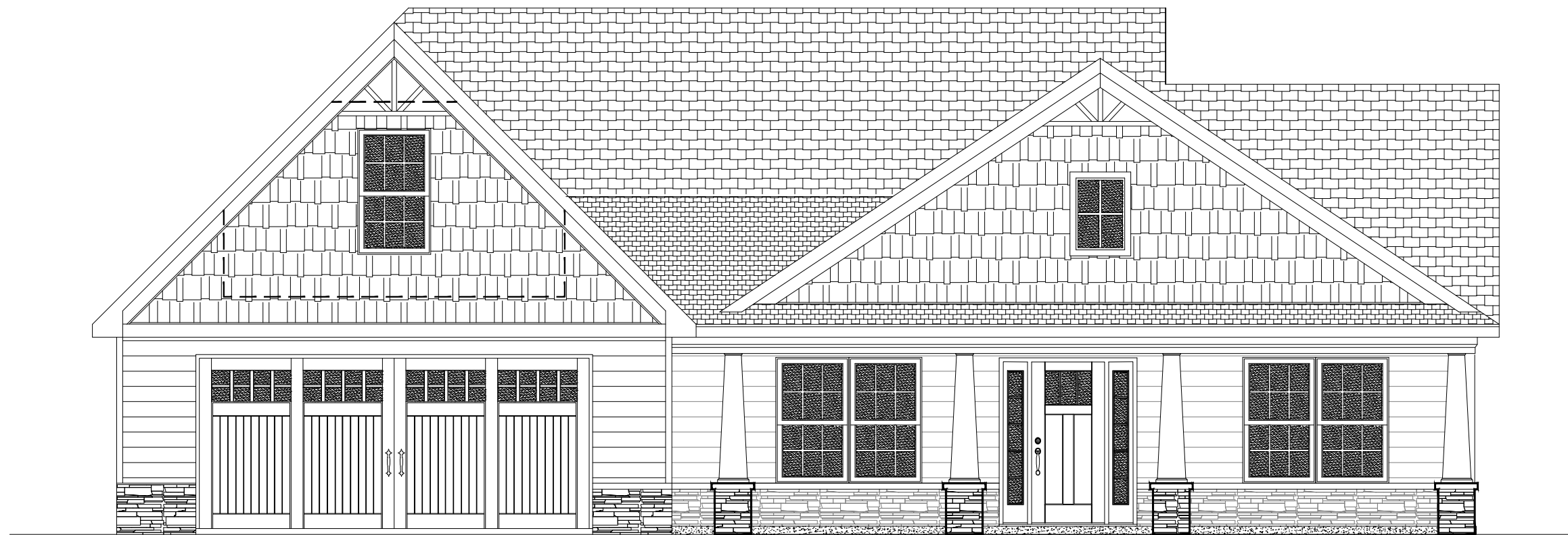
ELEVATION D - CRAFTSMAN HICKORY TRACT HOUSE