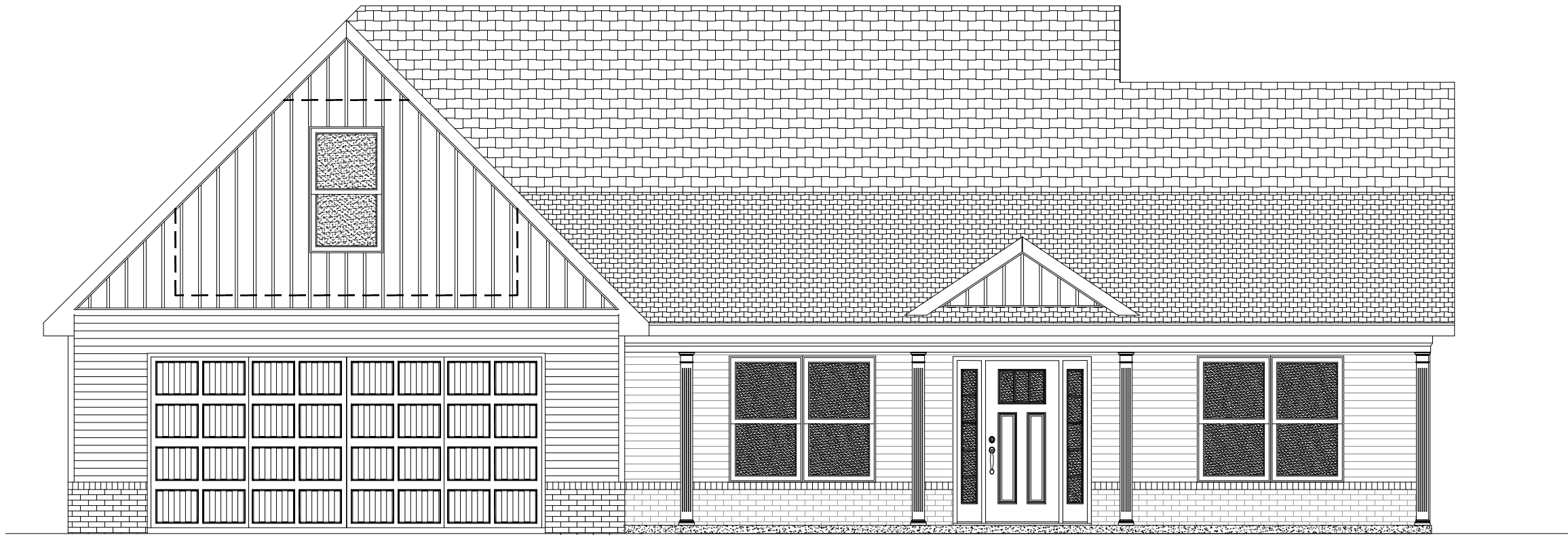
ELEVATION C - BRICK FRONT HICKORY TRACT HOUSE