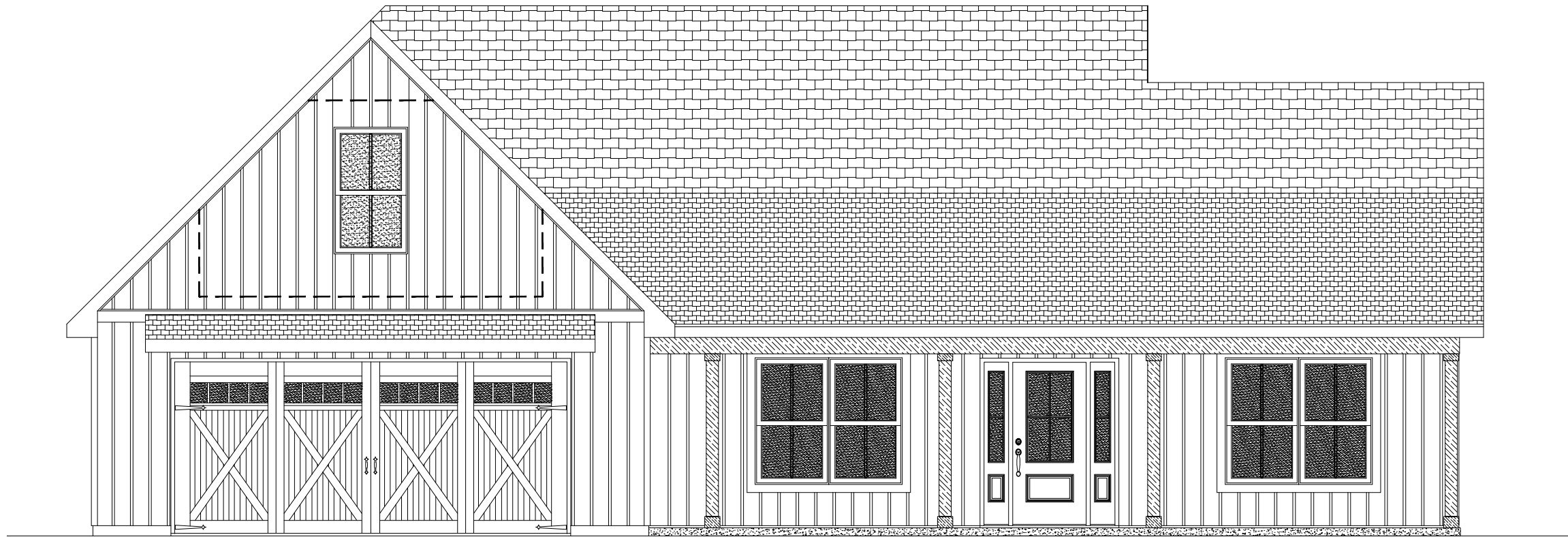
ELEVATION E - FARM HOUSE HICKORY TRACT HOUSE