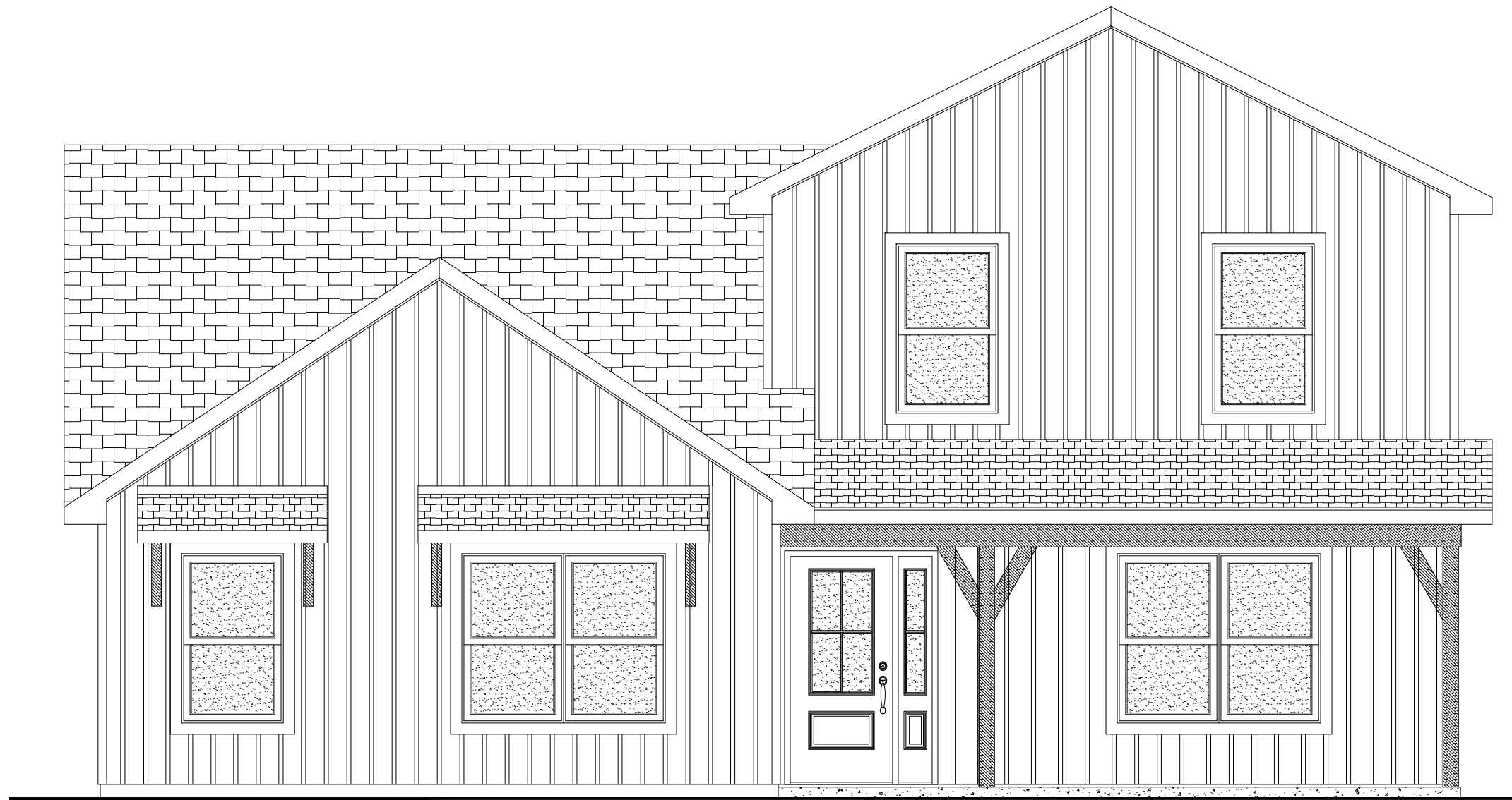
ELEVATION E - FARM HOUSE REAR LOAD DOGWOOD TRACT PLANS