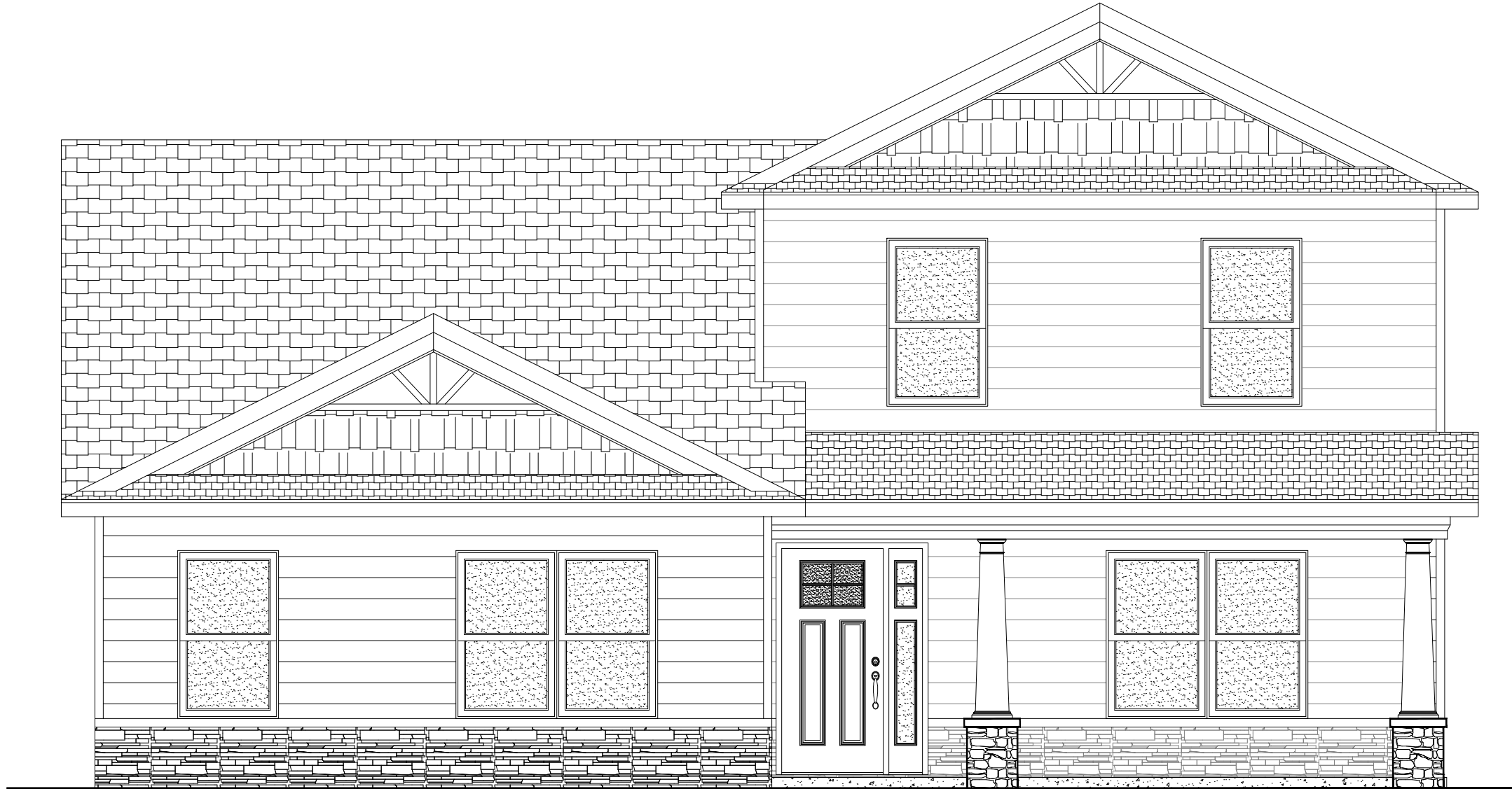
ELEVATION D - CRAFTSMAN REAR LOAD DOGWOOD TRACT HOUSE