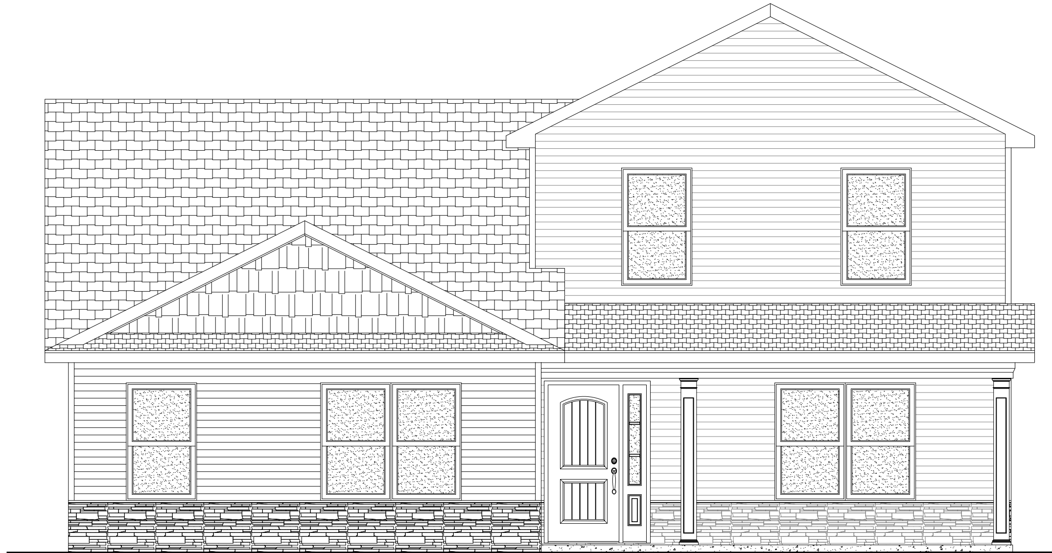
ELEVATION B - STONE FRONT REAR LOAD DOGWOOD TRACT HOUSE