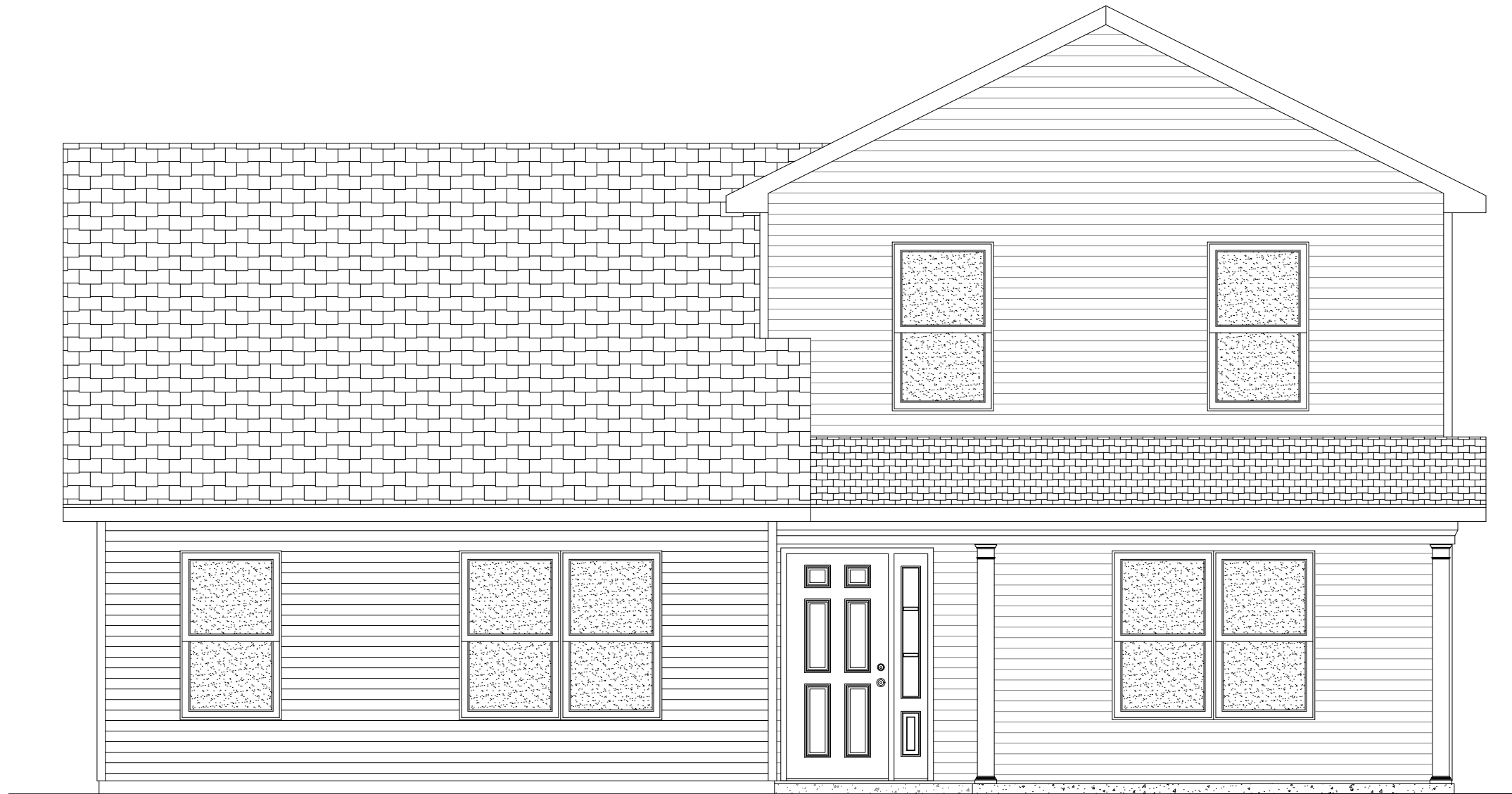
ELEVATION A - BASE VINYL REAR LOAD DOGWOOD TRACT HOUSE