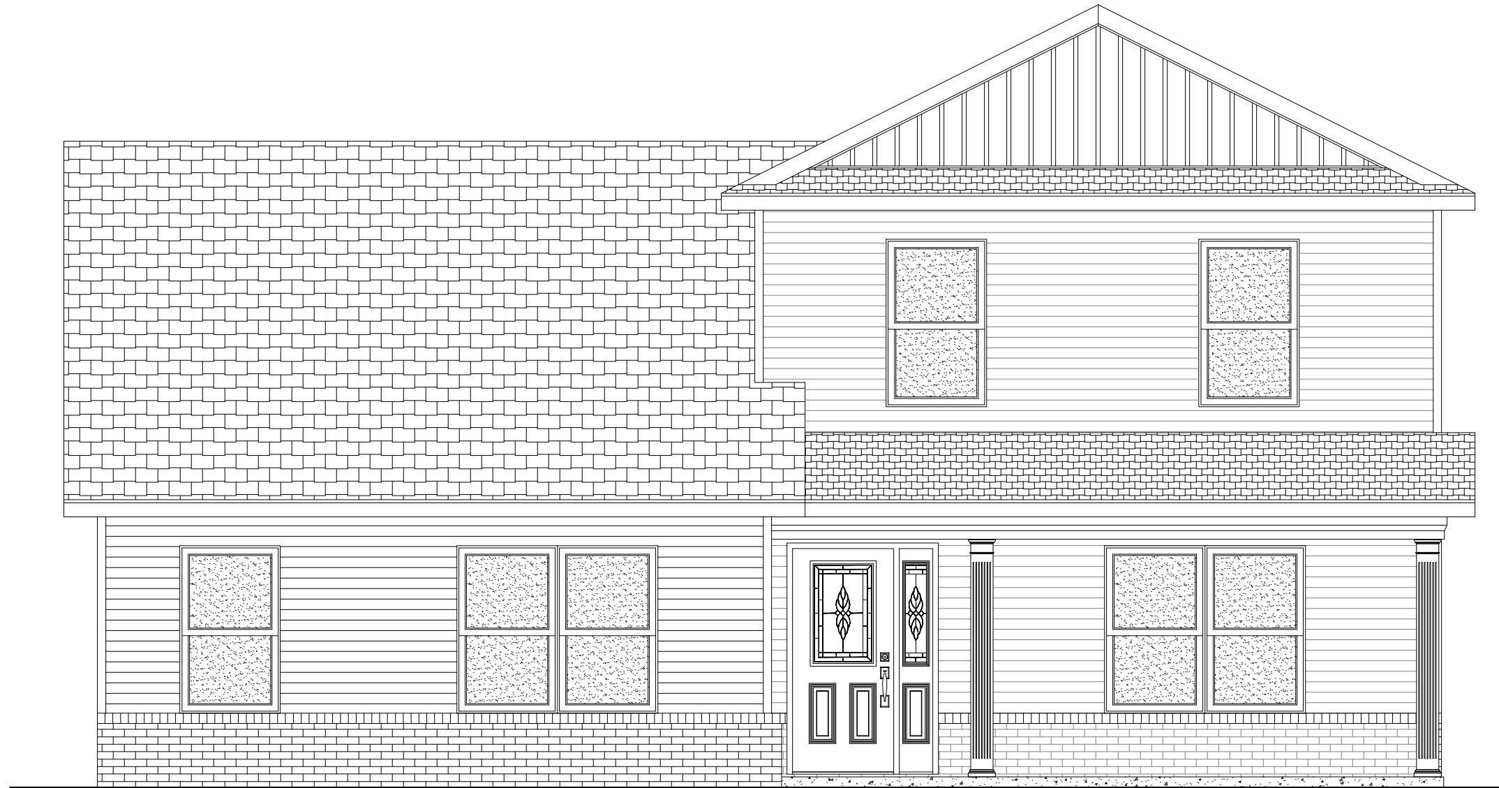
ELEVATION C - BRICK FRONT REAR LOAD DOGWOOD TRACT HOUSE