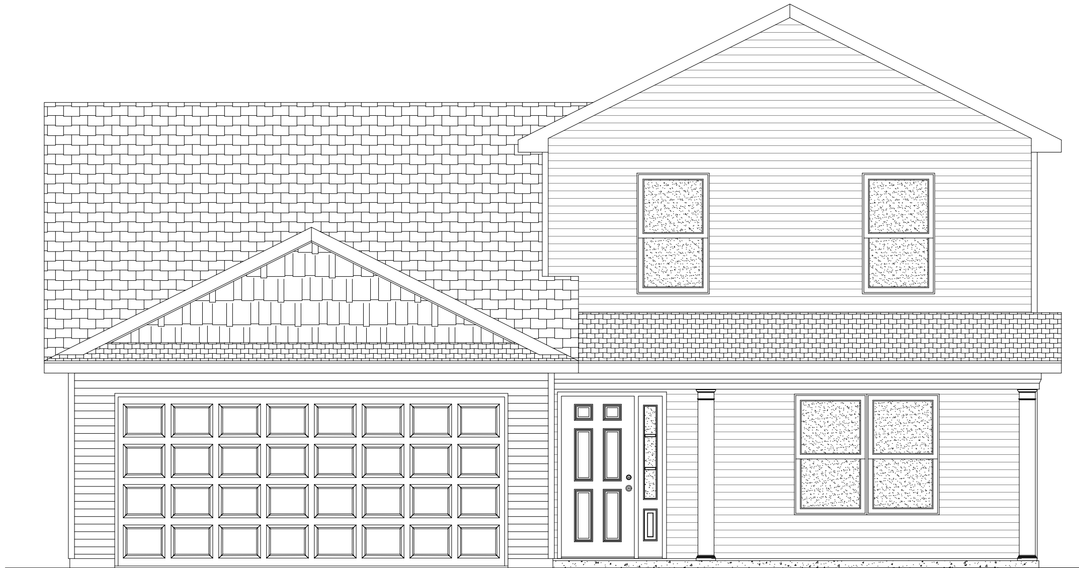
ELEVATION A - BASE VINYL DOGWOOD TRACT HOUSE