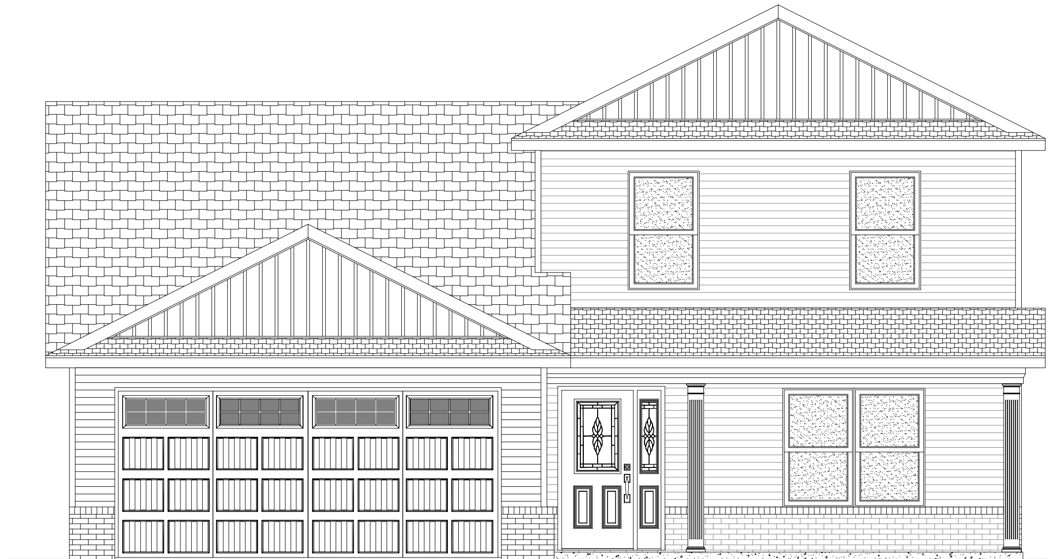
ELEVATION C - BRICK FRONT DOGWOOD TRACT HOUSE