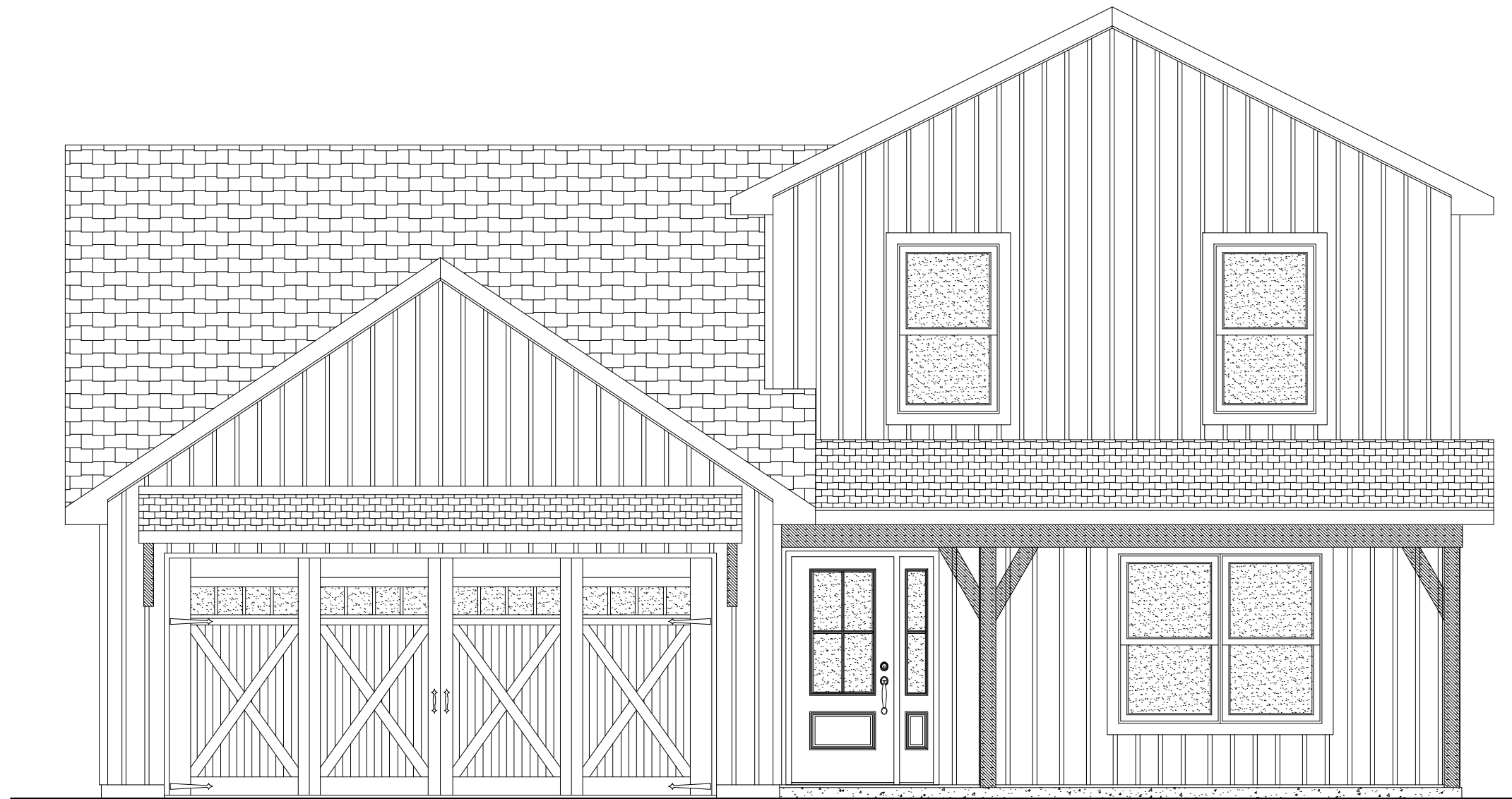
ELEVATION E - FARM HOUSE DOGWOOD TRACT HOUSE