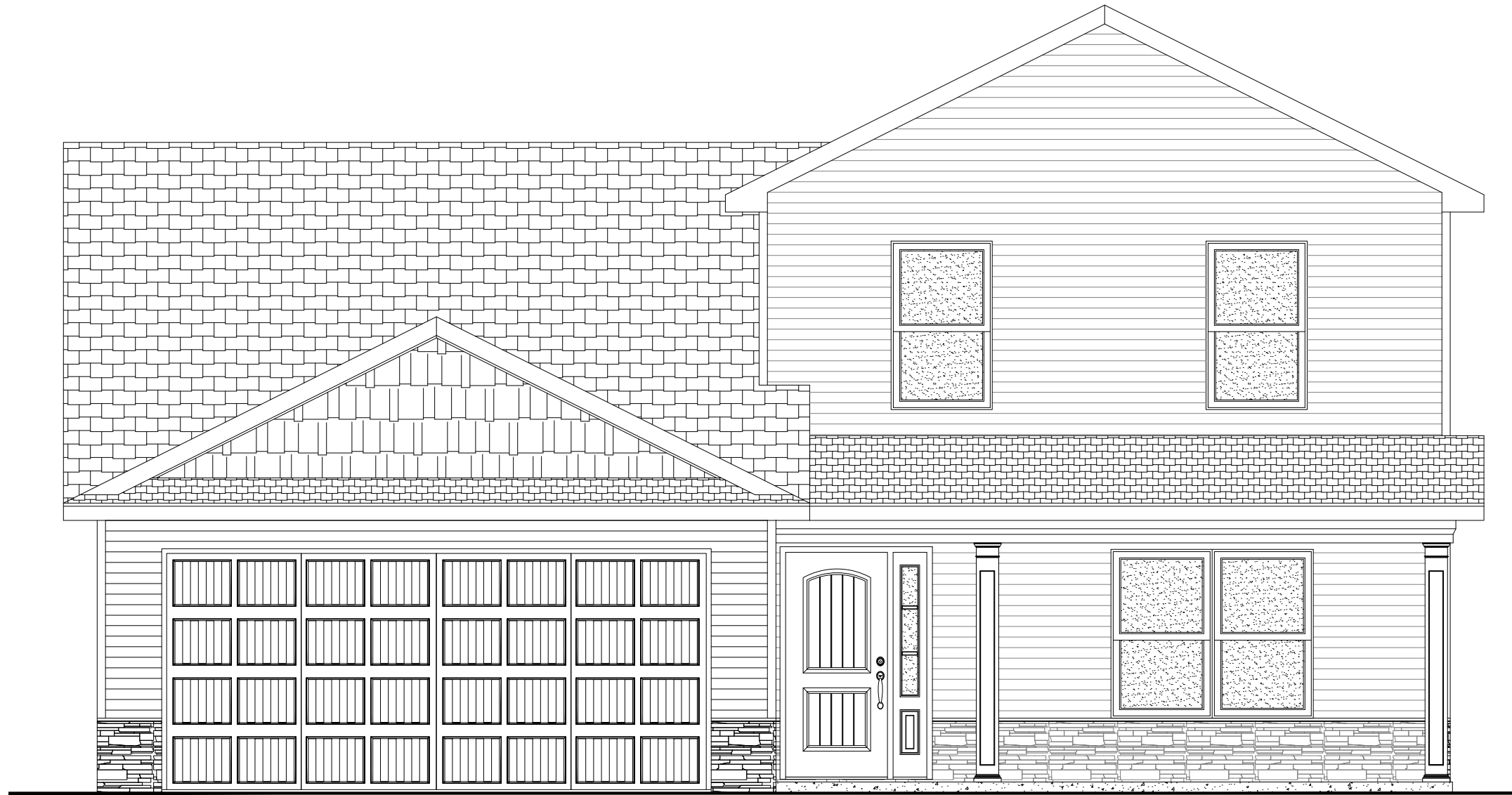
ELEVATION B - STONE FRONT DOGWOOD TRACT HOUSE