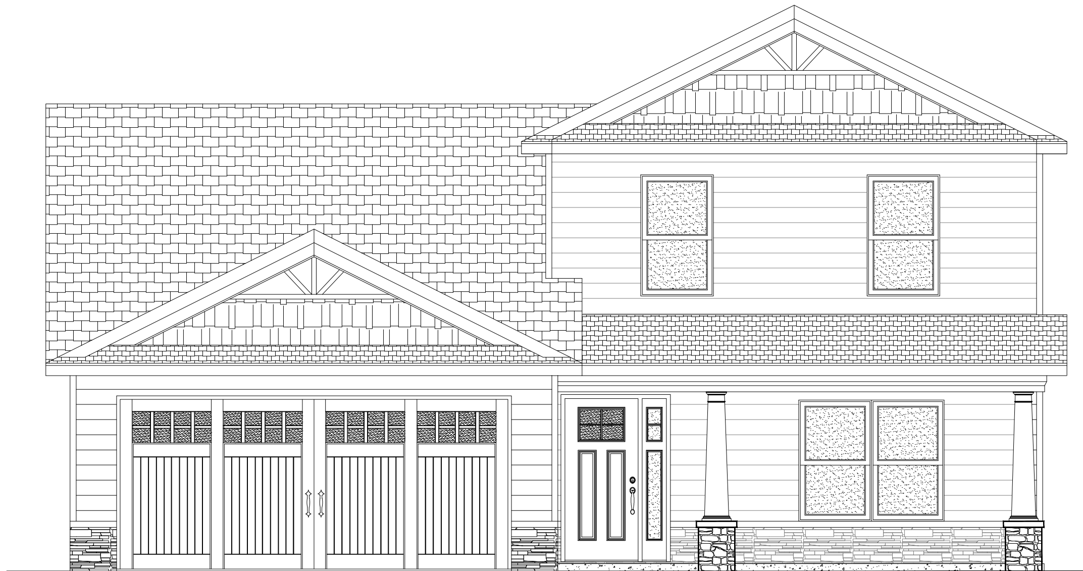
ELEVATION D - CRAFTSMAN DOGWOOD TRACT HOUSE