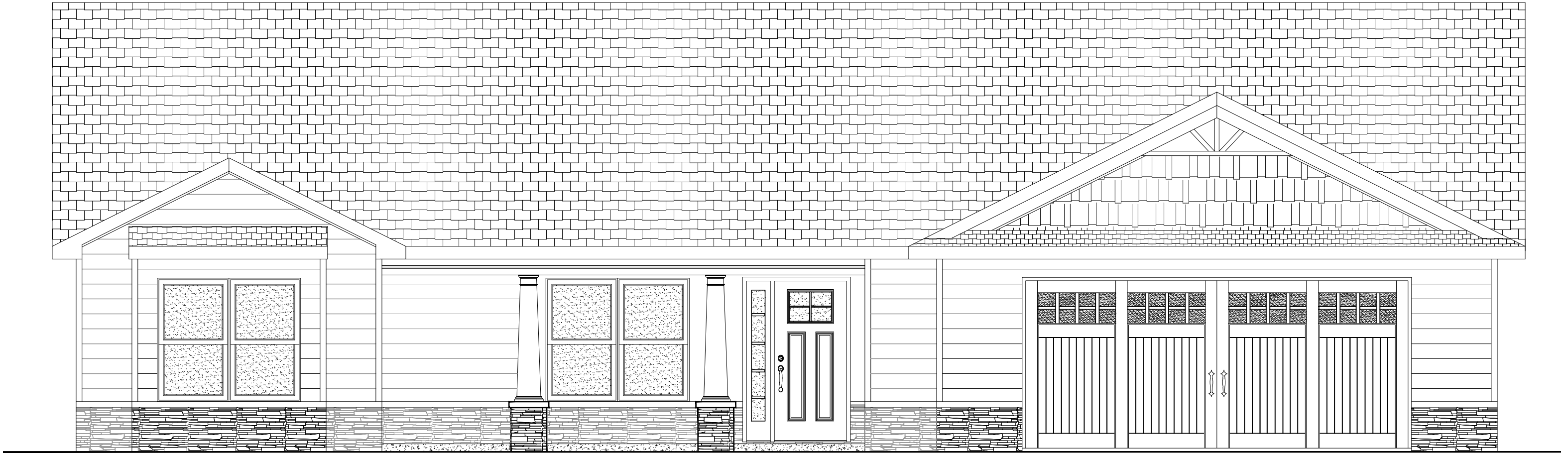
ELEVATION D - CRAFTSMAN TOPAZ TRACT HOUSE