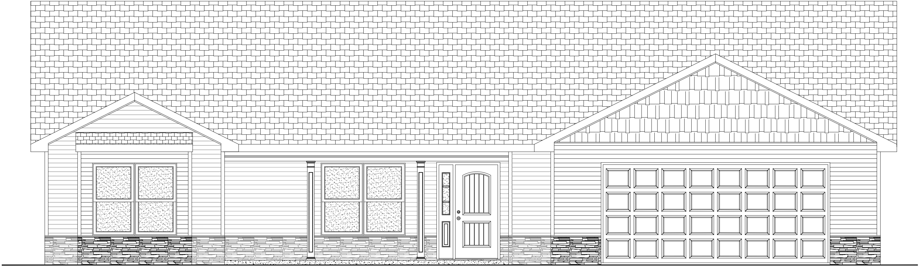
ELEVATION B - STONE FRONT TOPAZ TRACT HOUSE