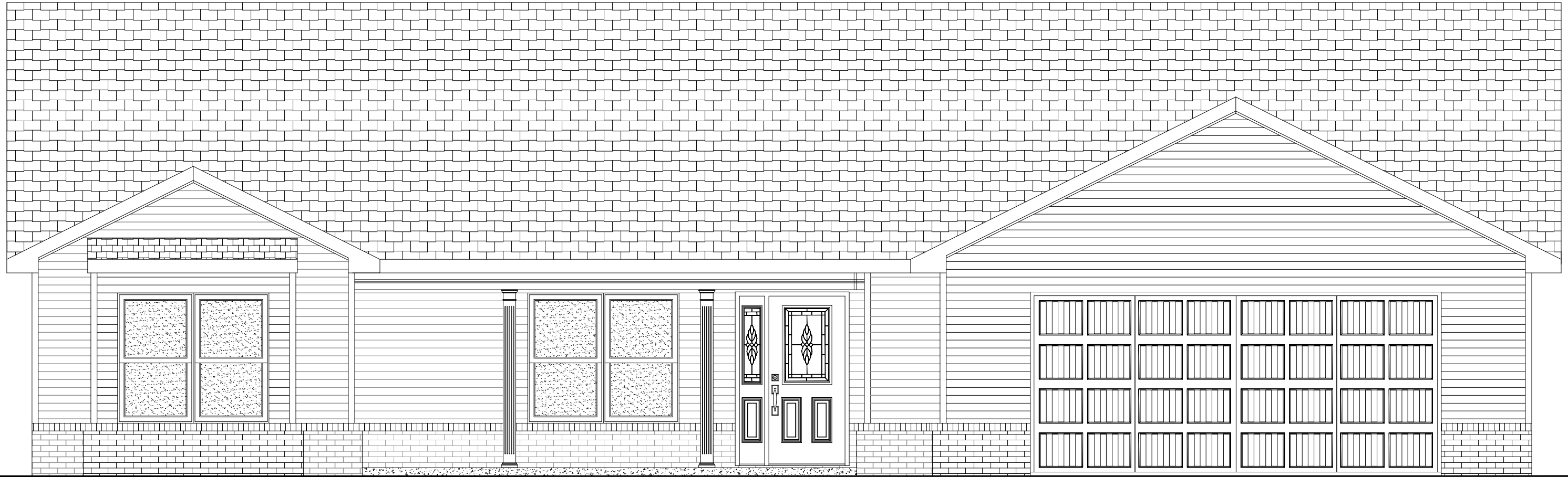
ELEVATION C - BRICK FRONT TOPAZ TRACT HOUSE