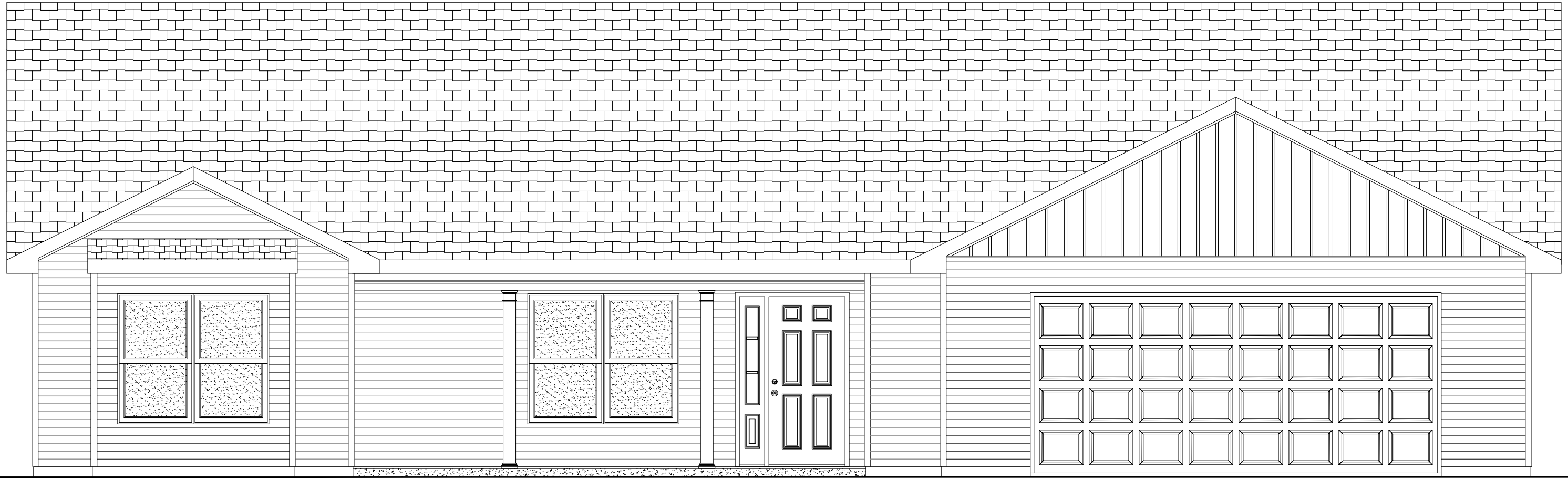
ELEVATION A - BASE VINYL TOPAZ TRACT HOUSE