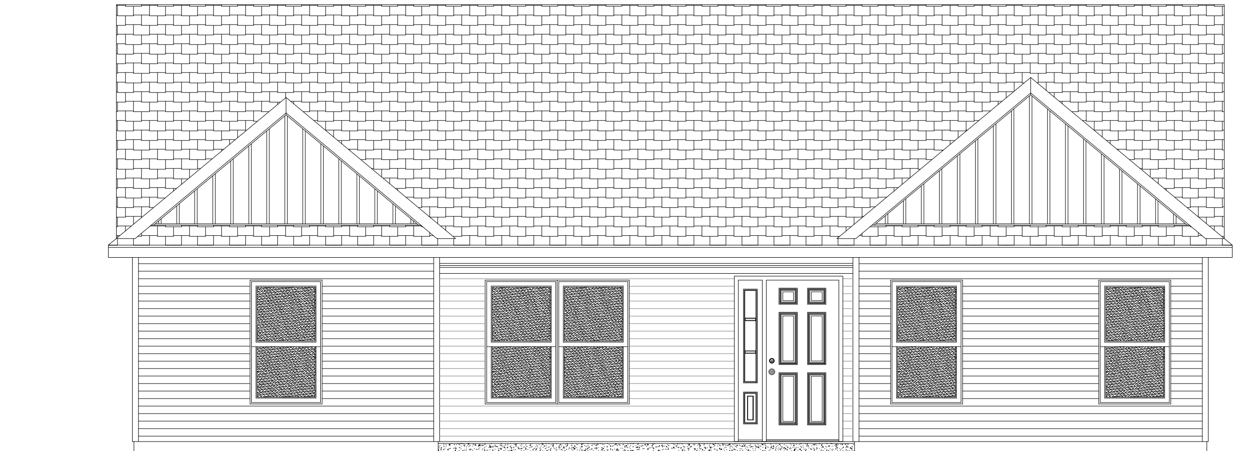
ELEVATION A - BASE VINYL EMERALD TRACT HOUSE