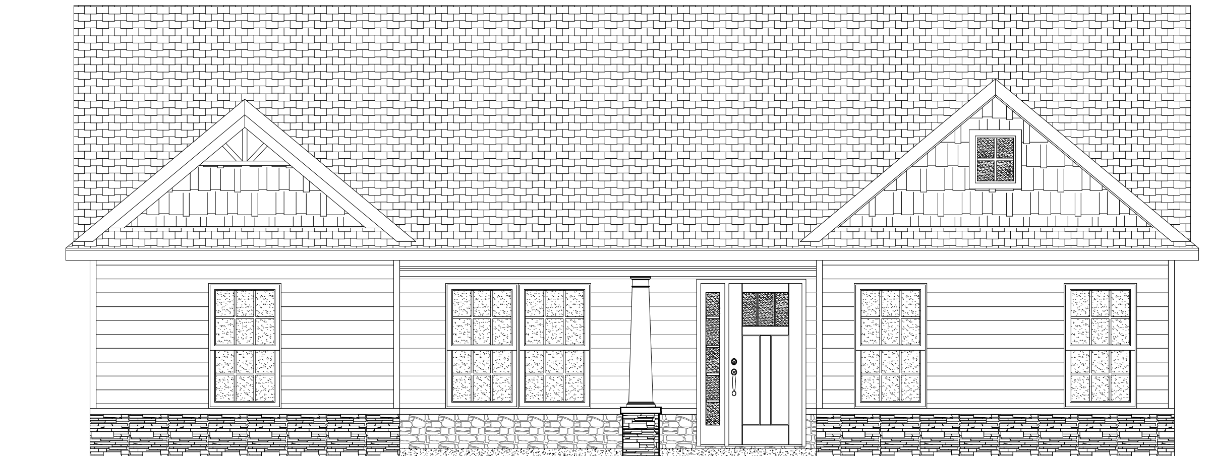
ELEVATION D - CRAFTSMAN EMERALD TRACT HOUSE