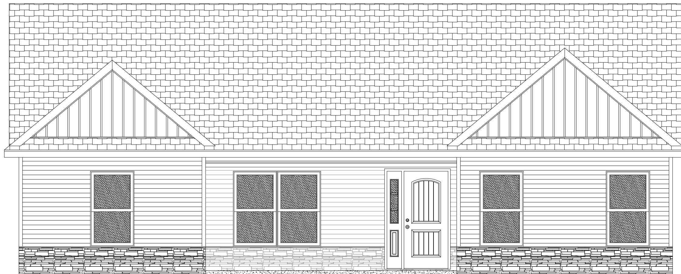
ELEVATION B - STONE FRONT EMERALD TRACT HOUSE