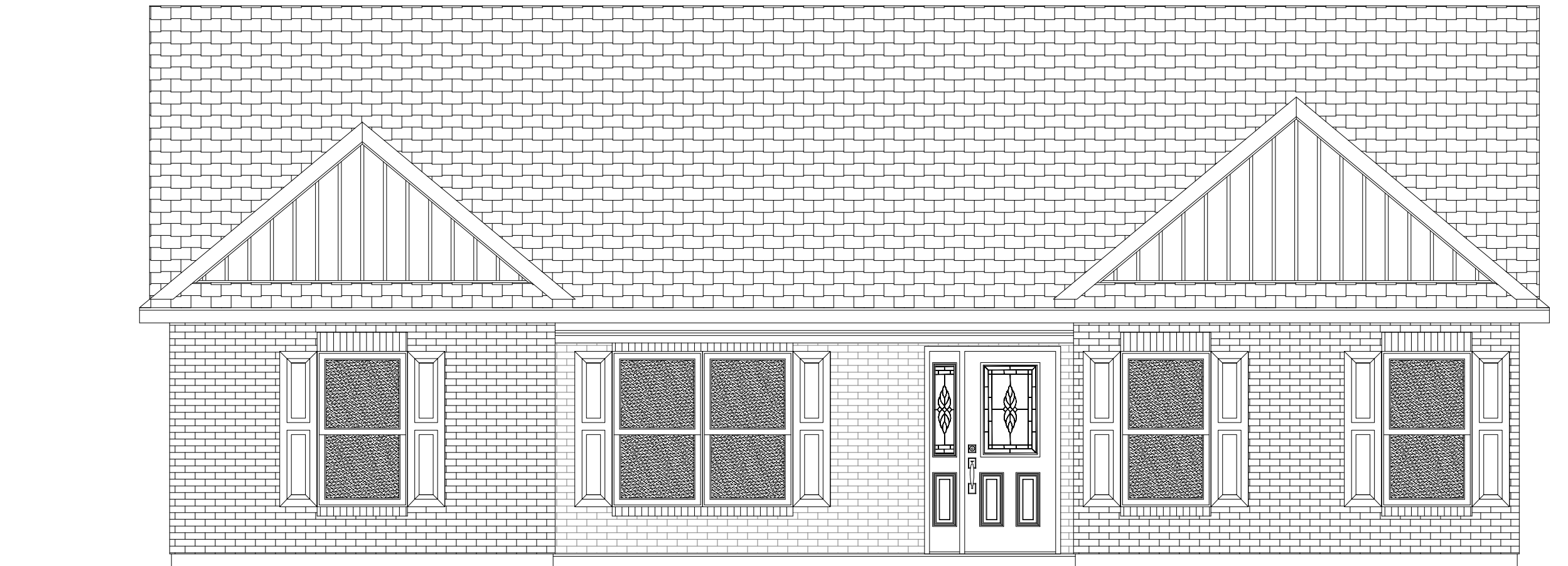
ELEVATION C - BRICK FRONT EMERALD TRACT HOUSE