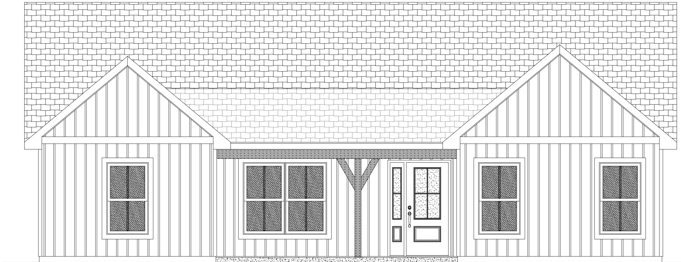
ELEVATION E - FARM HOUSE EMERALD TRACT HOUSE