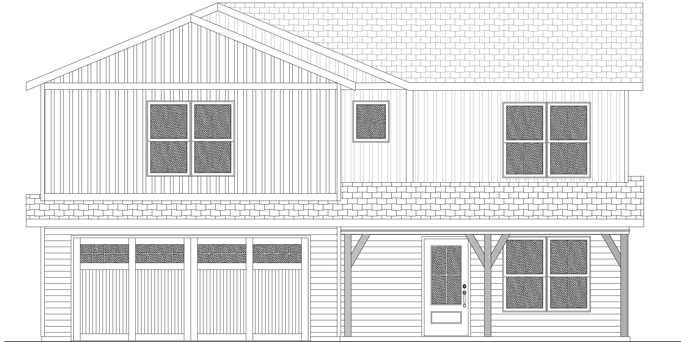
ELEVATION E - FARM HOUSE WALNUT TRACT HOUSE