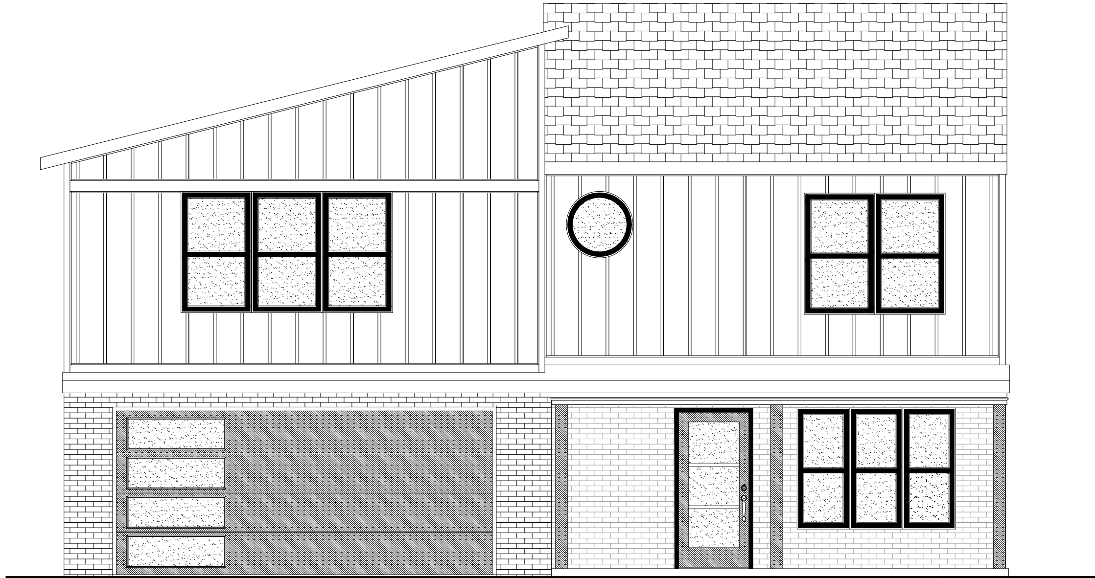
ELEVATION F - MODERN WALNUT TRACT HOUSE: