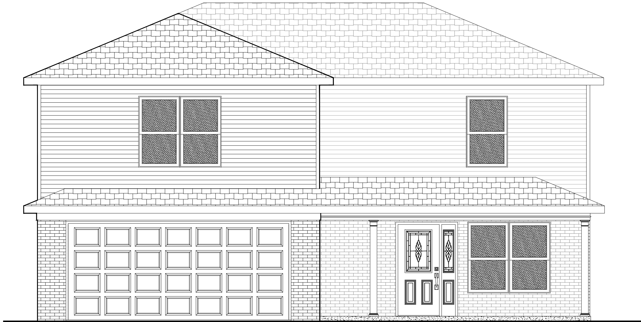
ELEVATION C - BRICK FRONT WALNUT TRACT HOUSE