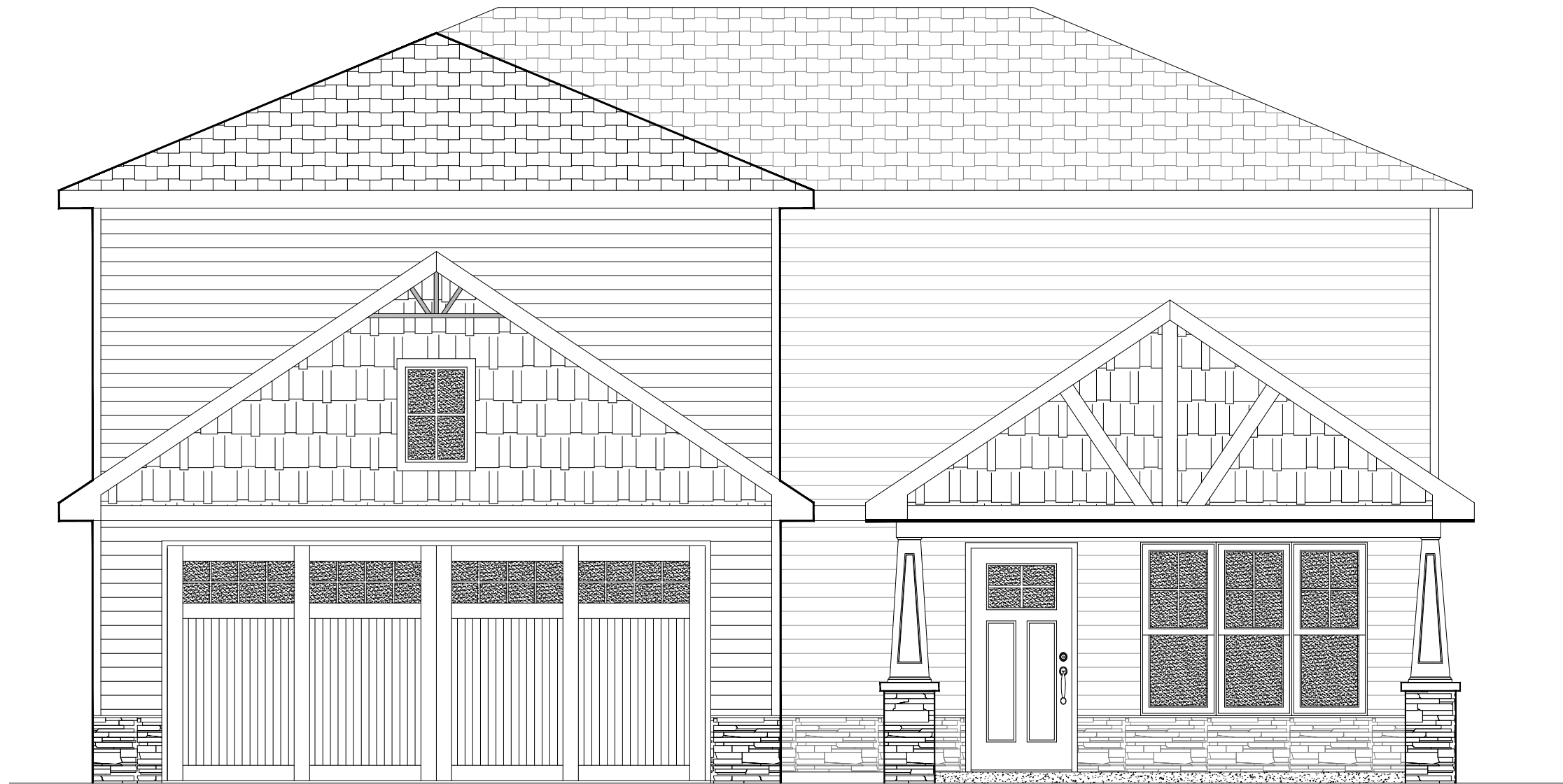
ELEVATION D - CRAFTSMAN WALNUT TRACT HOUSE