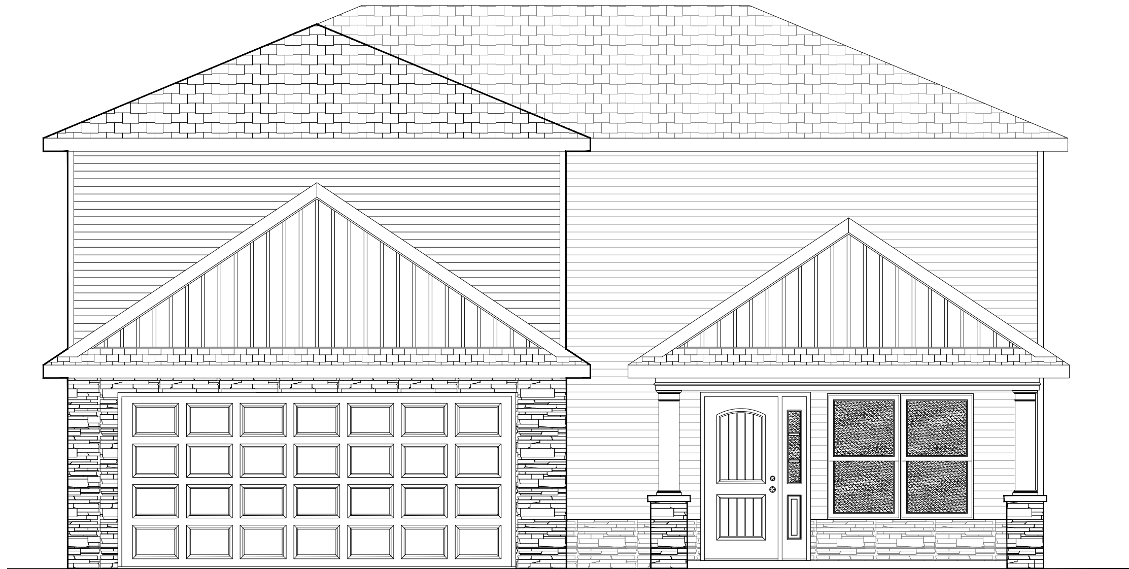
ELEVATION B - STONE FRONT WALNUT TRACT HOUSE