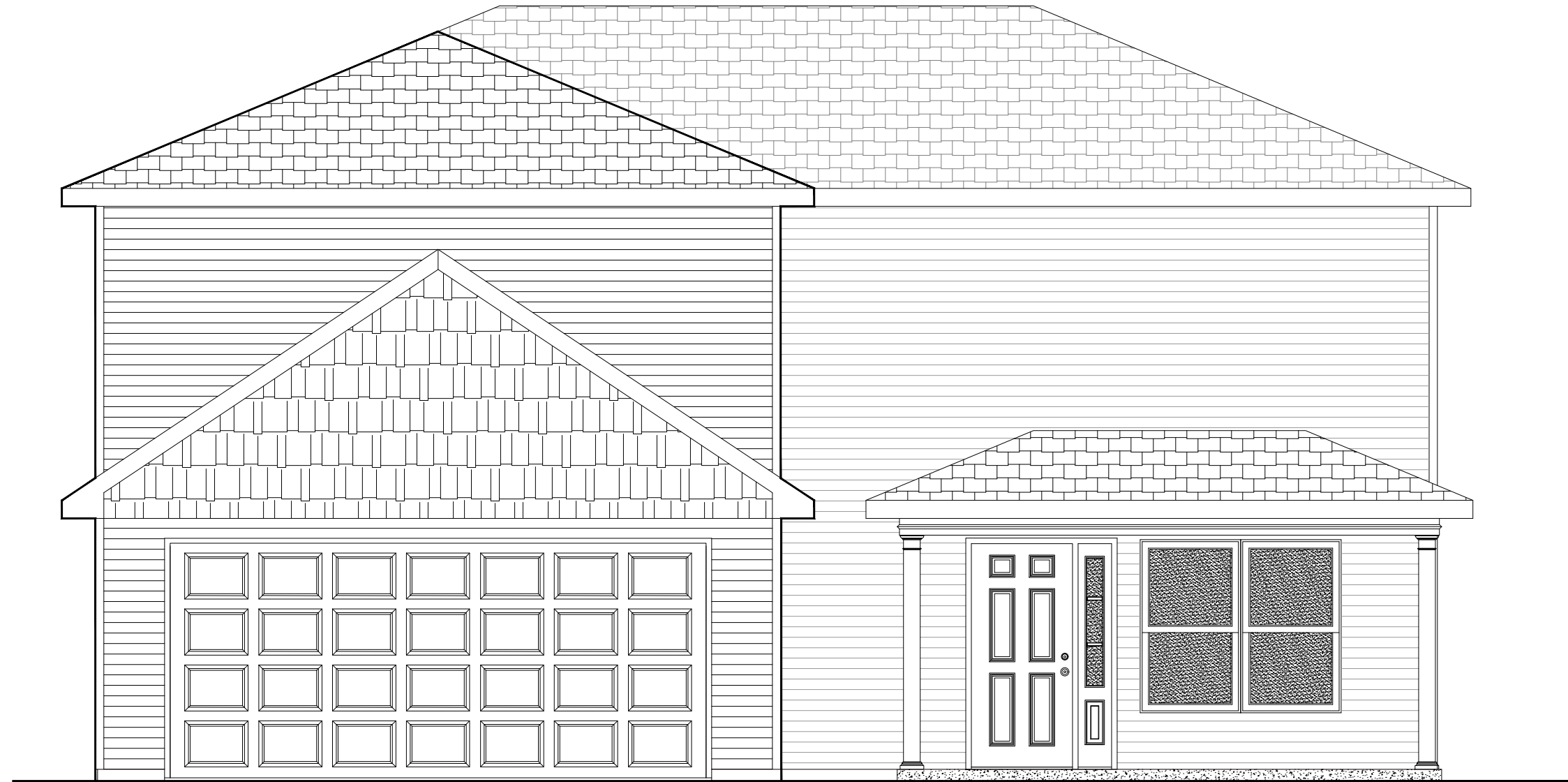
ELEVATION A - BASE VINYL WALNUT TRACT HOUSE