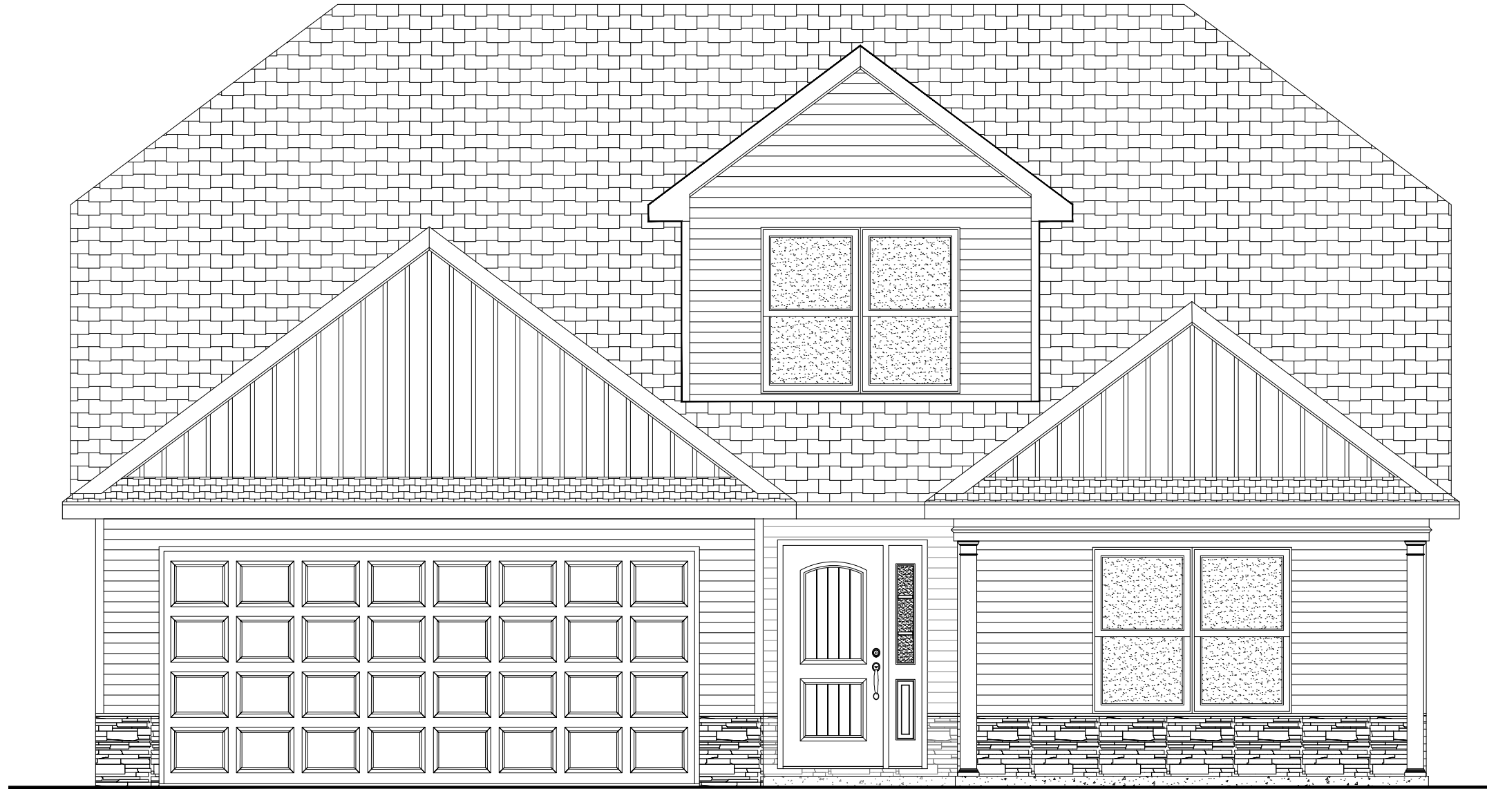
ELEVATION B - STONE FRONT COBALT TRACT HOUSE