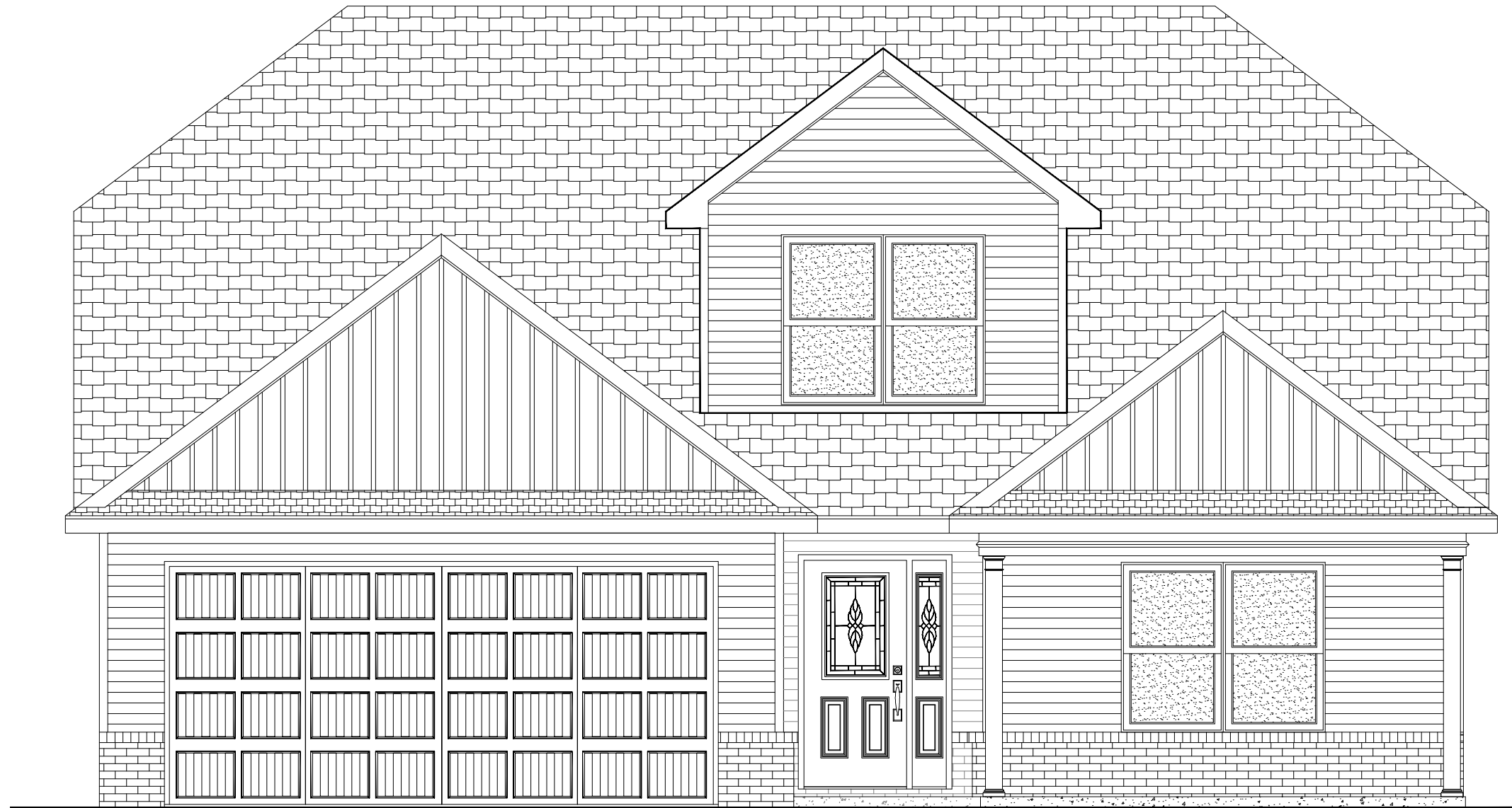
ELEVATION C - BRICK FRONT COBALT TRACT HOUSE