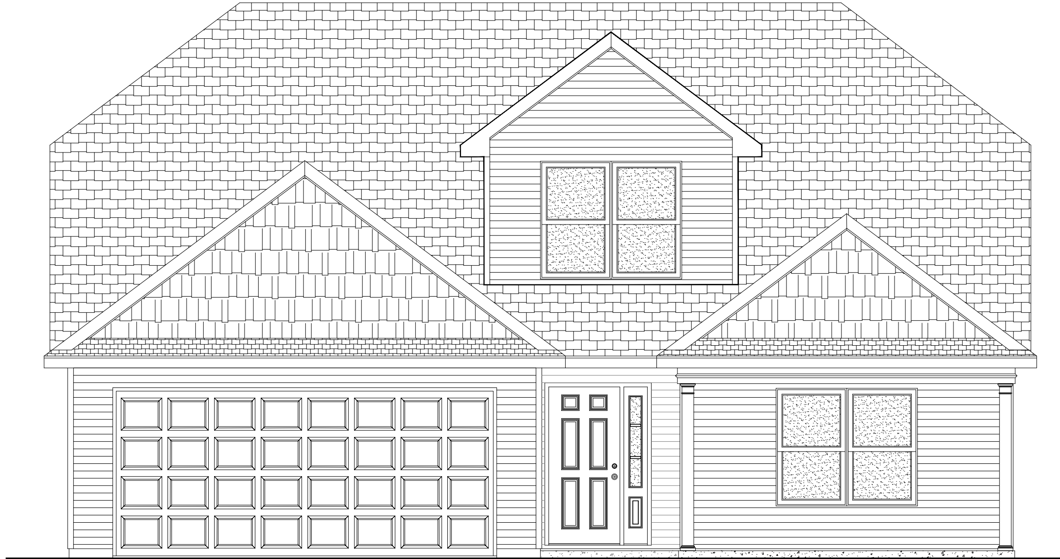
ELEVATION A - BASE VINYL COBALT TRACT HOUSE