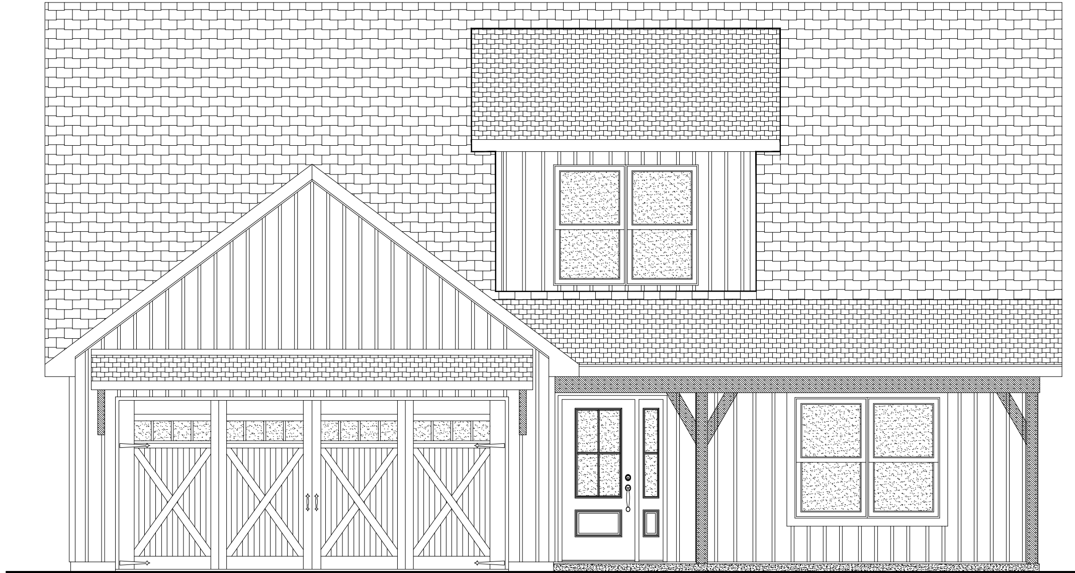
ELEVATION E - FARM HOUSE COBALT TRACT HOUSE