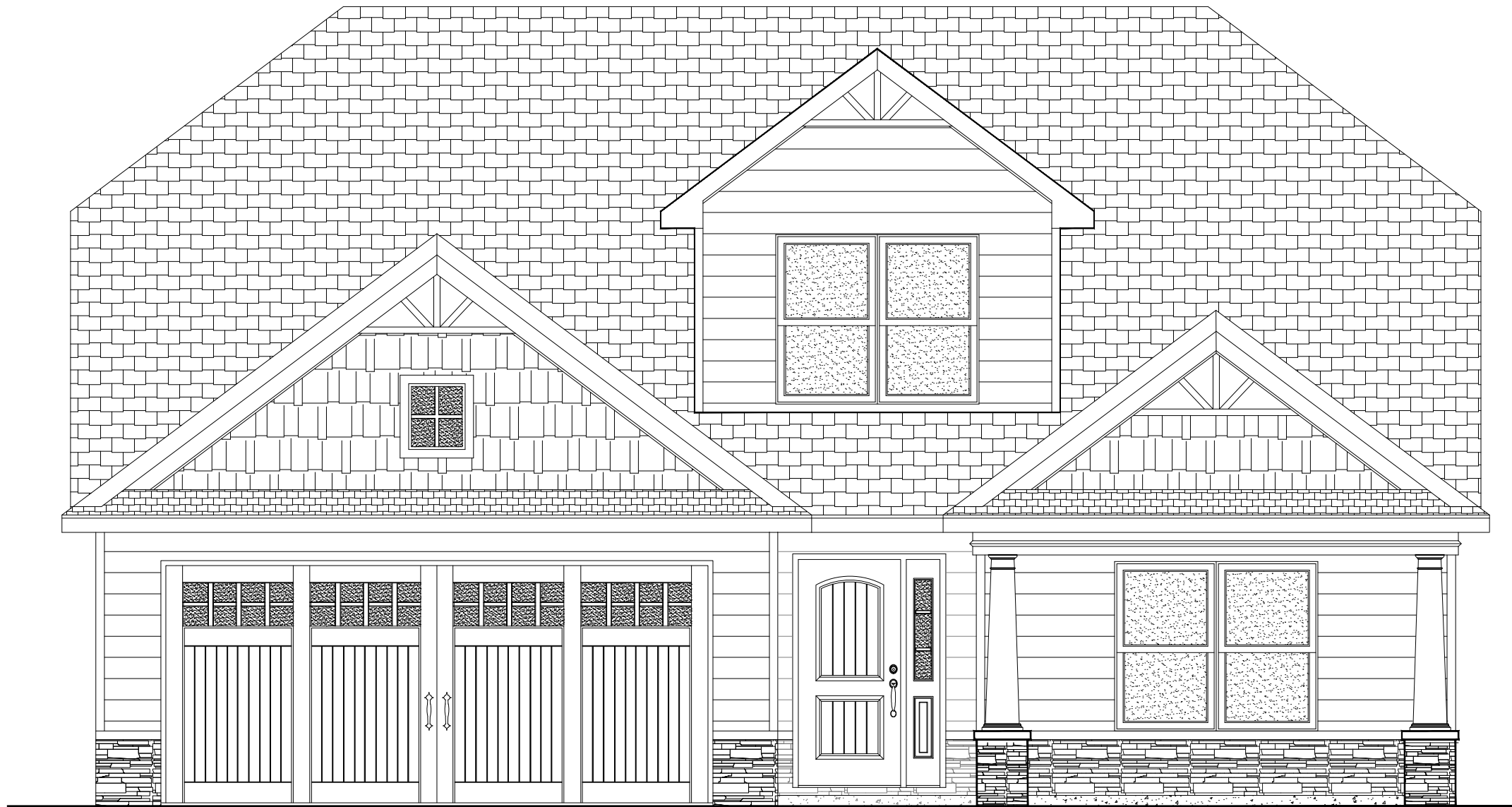
ELEVATION D - CRAFTSMAN COBALT TRACT HOUSE