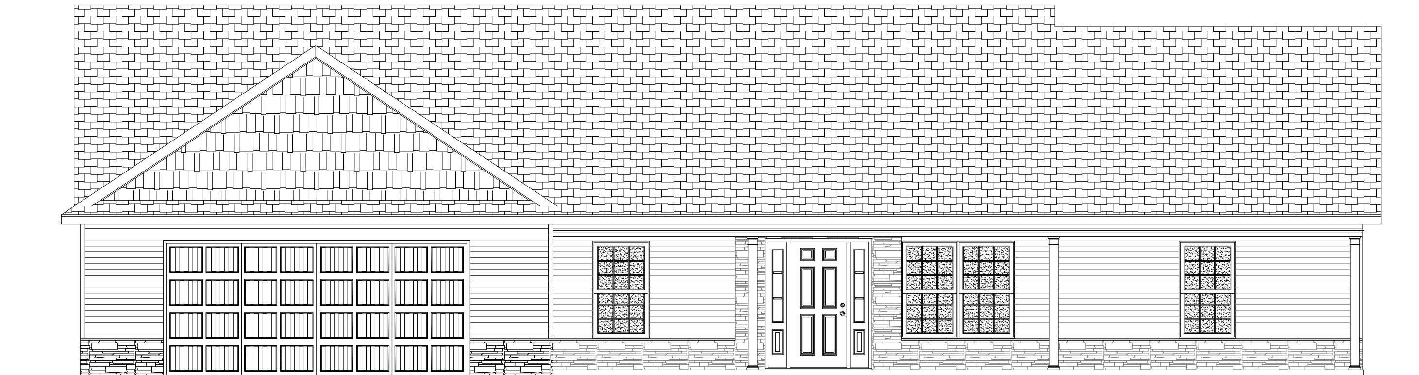
ELEVATION B - STONE FRONT LOCUST TRACT HOUSE