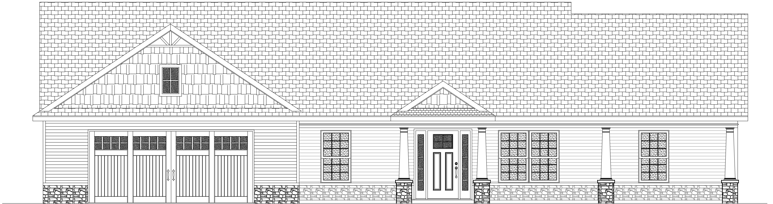
ELEVATION D - CRAFTSMAN LOCUST TRACT HOUSE