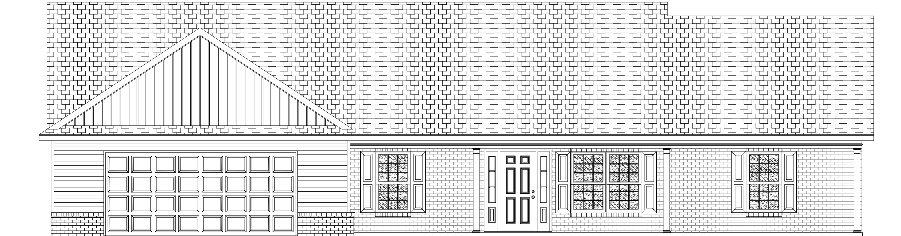
ELEVATION C - BRICK FRONT LOCUST TRACT HOUSE