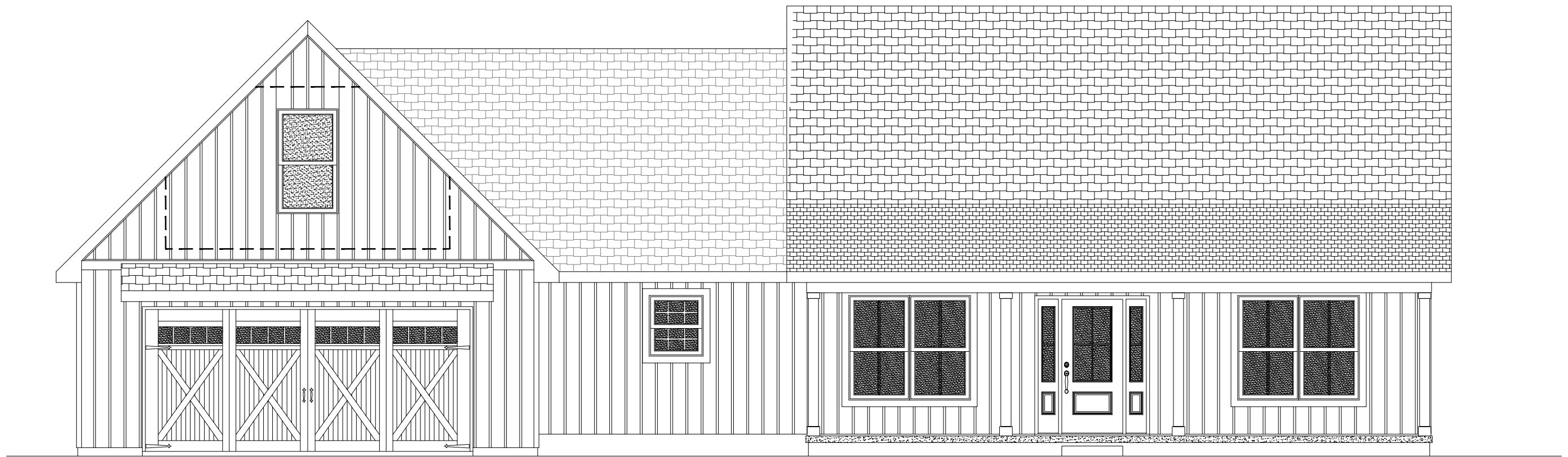
ELEVATION E - FARM HOUSE COTTONWOOD TRACT HOUSE