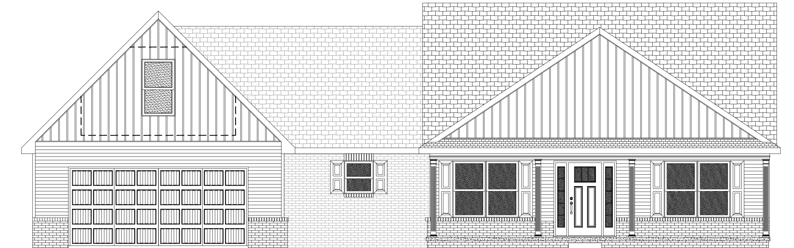
ELEVATION C - BRICK FRONT COTTONWOOD TRACT HOUSE