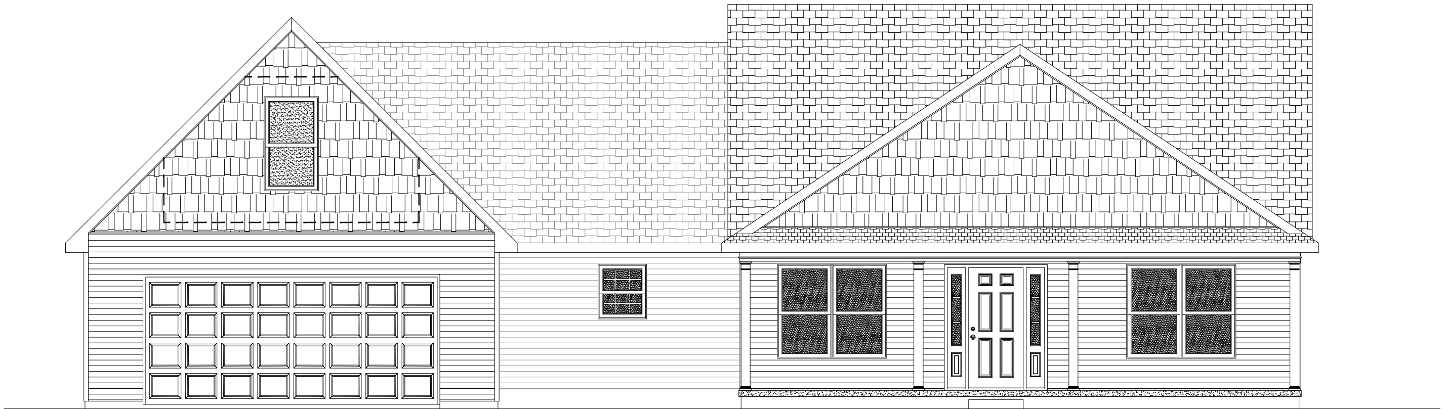
ELEVATION A - BASE VINYL COTTONWOOD TRACT HOUSE