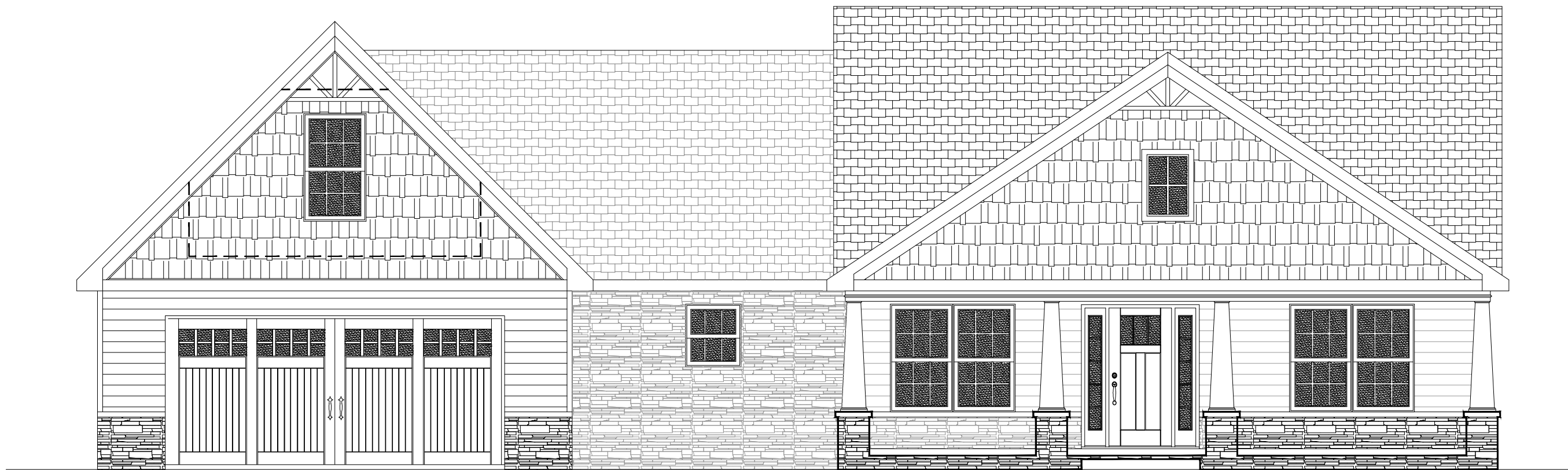
ELEVATION D - CRAFTSMAN COTTONWOOD TRACT HOUSE