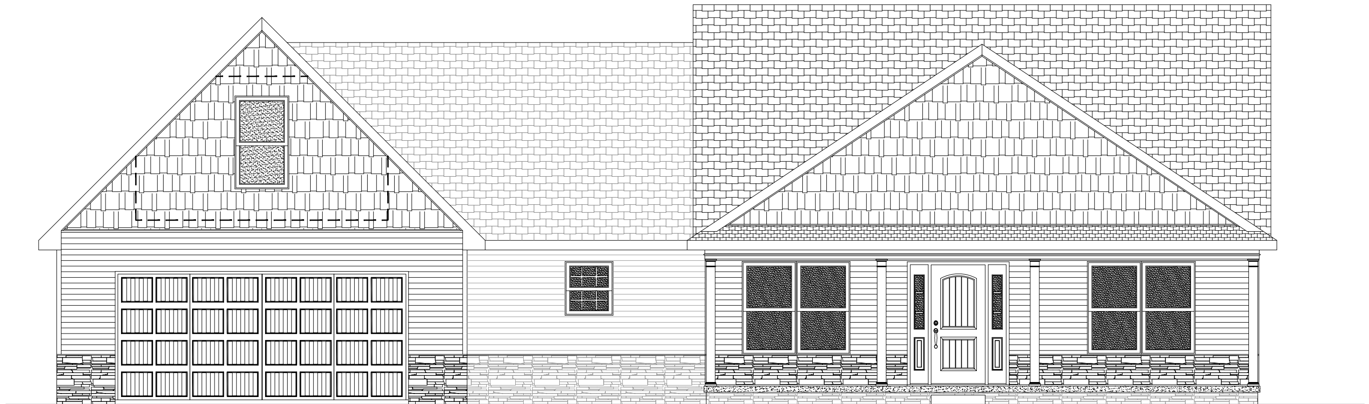
ELEVATION B - STONE FRONT COTTONWOOD TRACT HOUSE