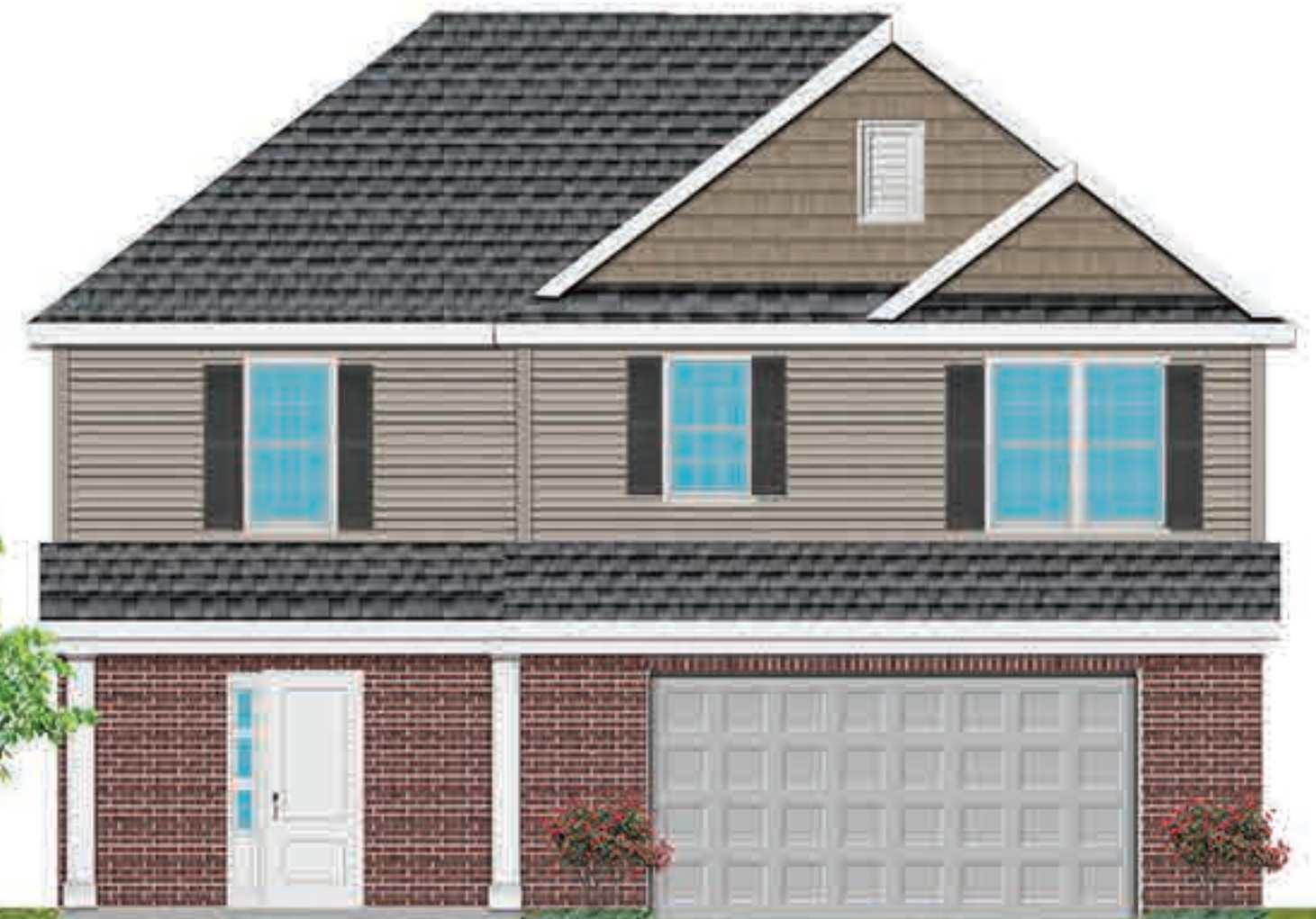
FRONT ELEVATION C