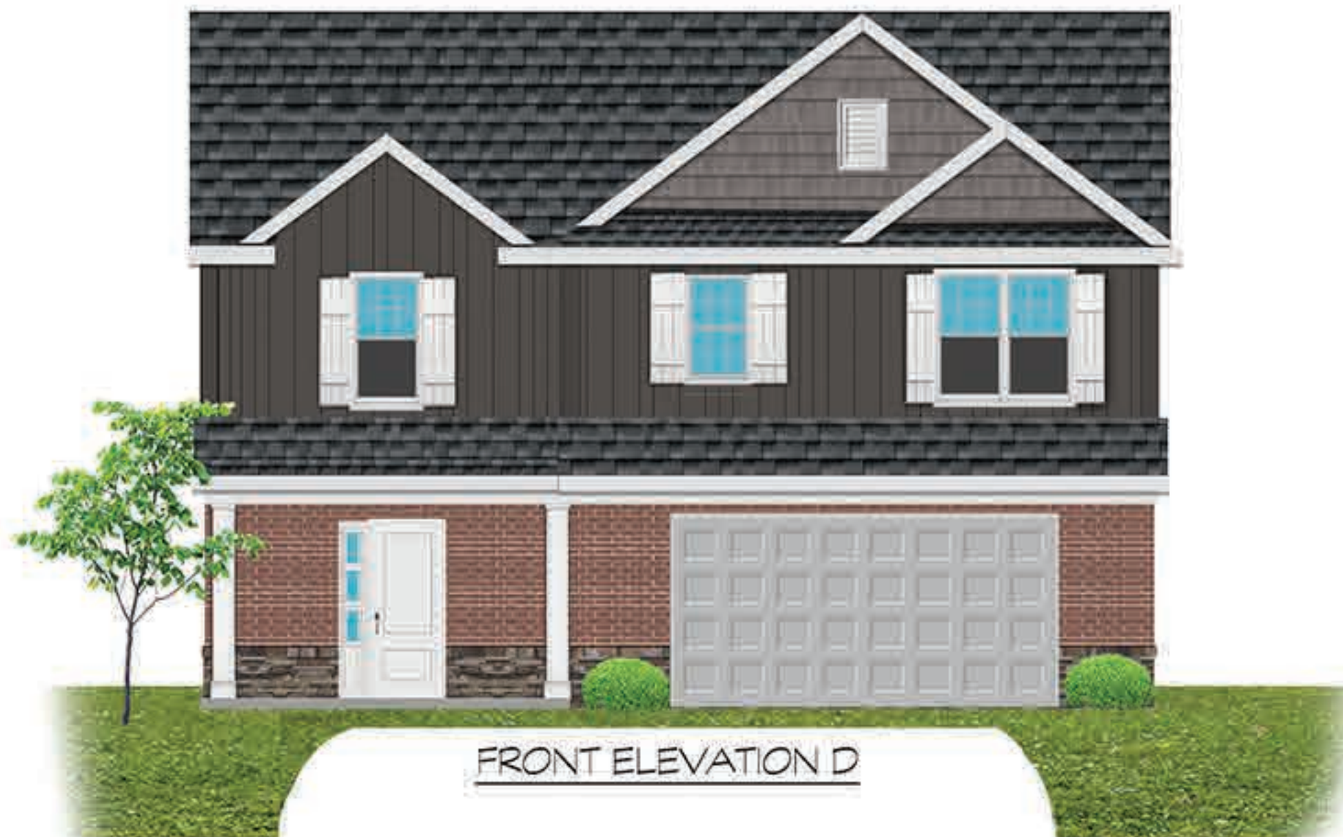
FRONT ELEVATION D