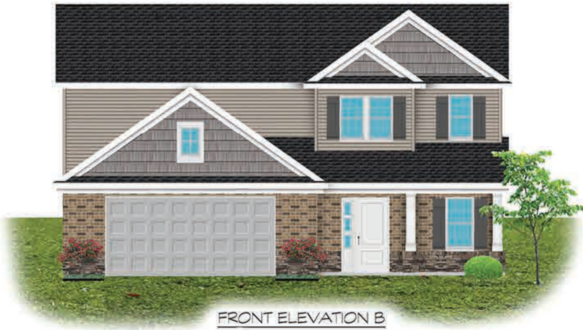
FRONT ELEVATION B