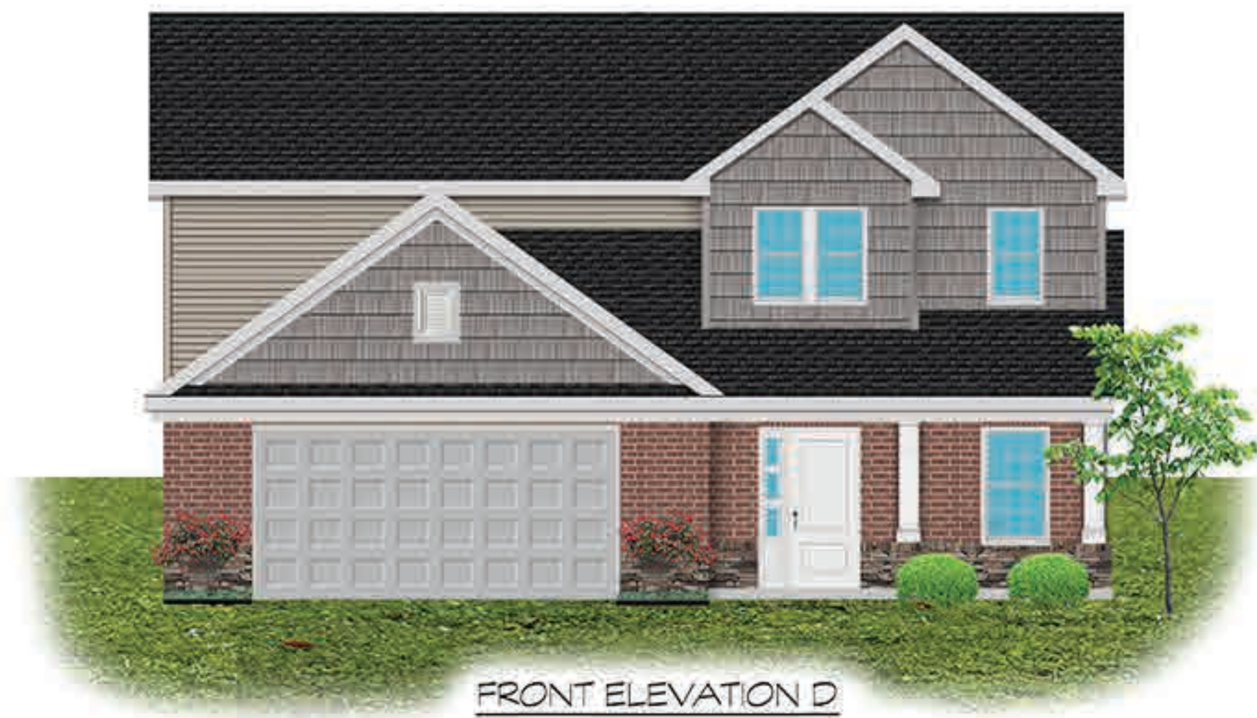
FRONT ELEVATION D