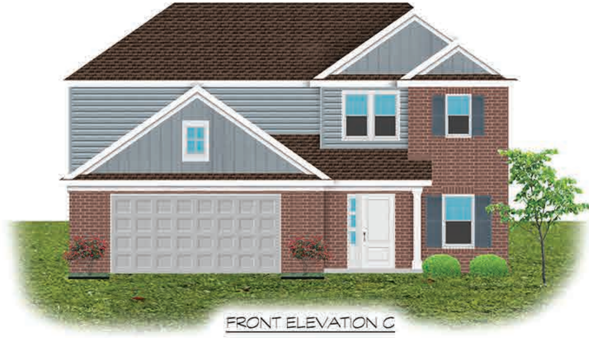
FRONT ELEVATION C