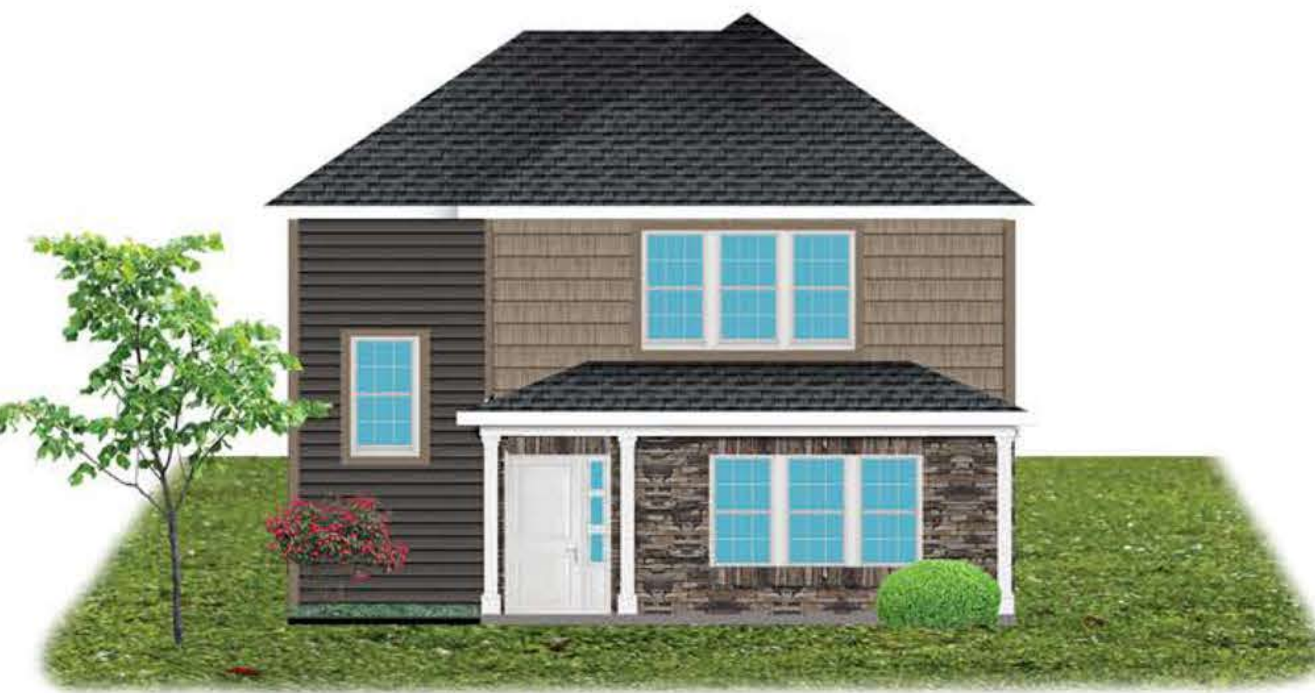
FRONT ELEVATION C