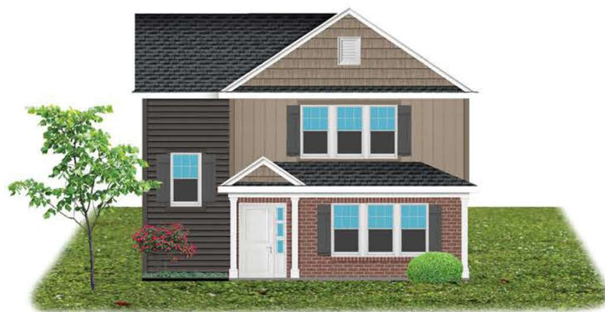
FRONT ELEVATION D